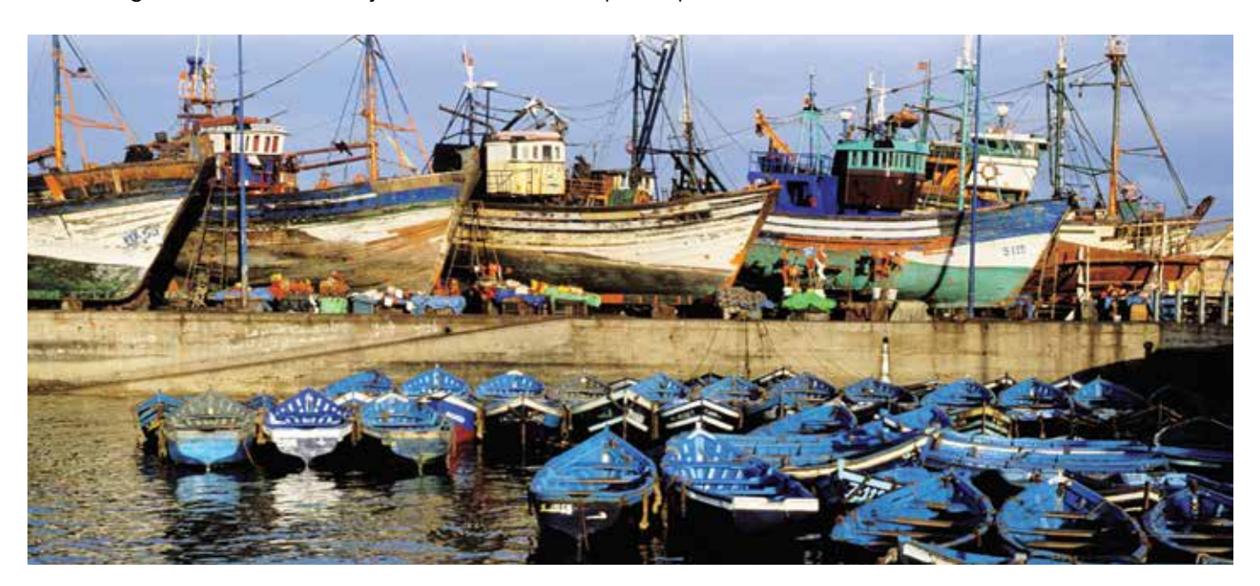
Fishing harbor, Essaouira, Morocco