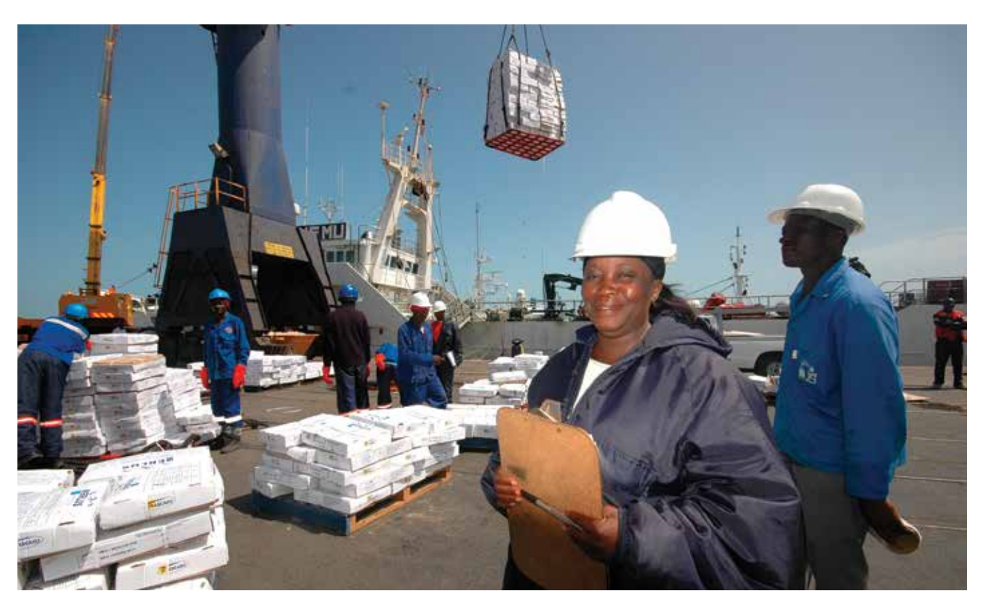
Port of Walvis Bay, Namibia