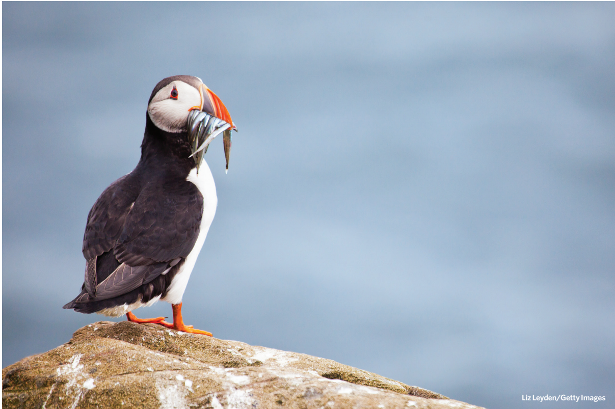
Atlantic Puffin ( Fratercula arctica ) with sandeels