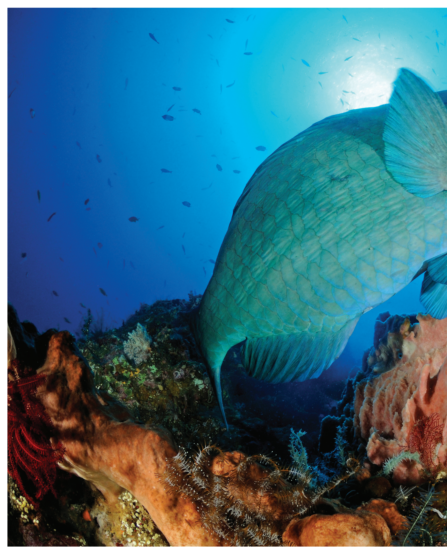
In 1994, the same year Palau became independent, it passed the Marine Protection Act, which included a moratorium on fishing for bumphead parrotfish.