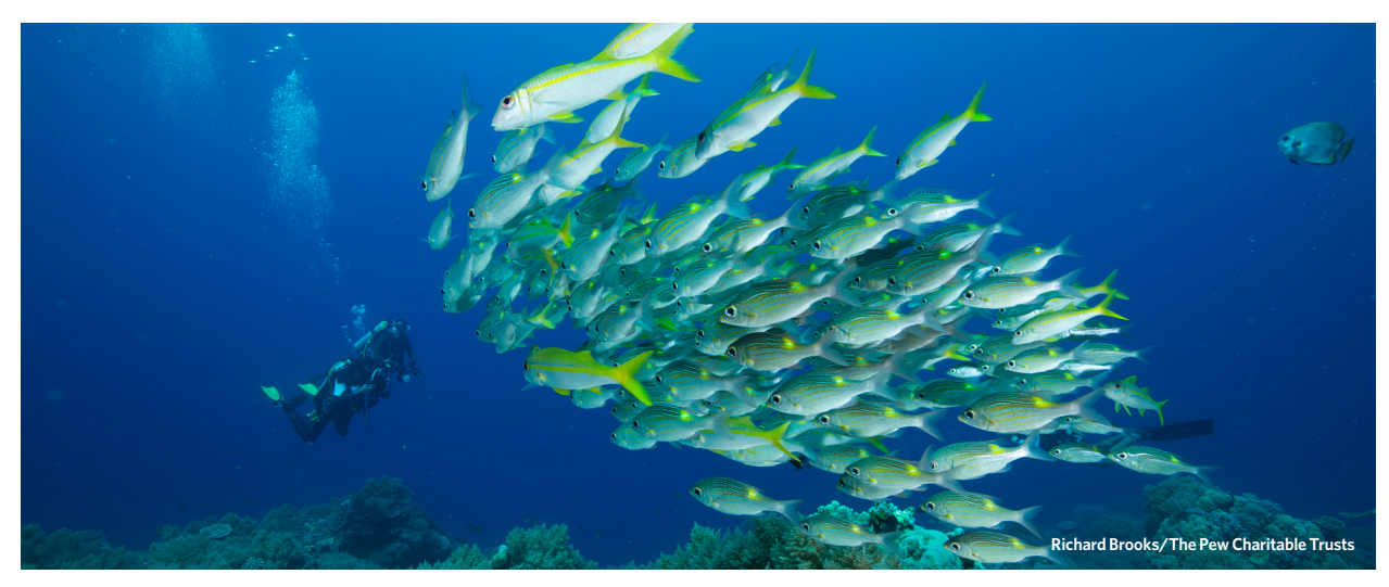
Diving generates about $90 million a year for Palau's economy.

To ensure the sustainability and feasibility of this massive endeavor, the sanctuary will be phased in over a five-year period. A separate zone reserved for local fishermen and small-scale commercial fisheries with limited exports will cover the remainder of Palau's waters. Coastal waters from shore to 22 kilometers (12 nautical miles) will not be affected and will be managed under current regulations.