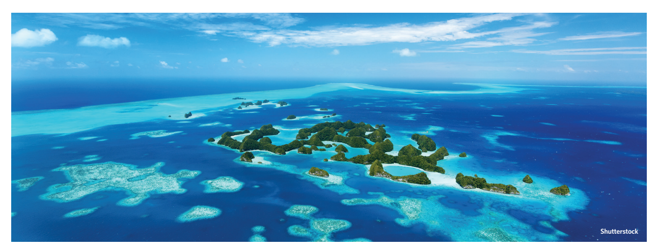
The Rock Islands, a UNESCO World Heritage site, include 445 uninhabited limestone islands of volcanic origin.