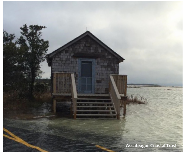
Assateague Coastal Trust

Coastal storms wash over roads and parking lots at Old Ferry Landing and elsewhere in the park, damaging buildings and roadways.