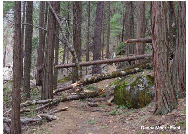
Danna Moore Pfahl

Fallen trees lie across a trail in Yosemite National Park, part of a half-billion-dollar deferred maintenance problem there.