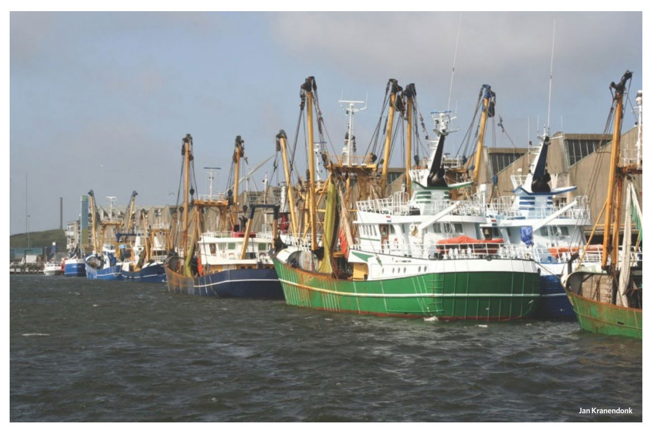
Fisheries management authorities can track fishing fleets more effectively if vessel monitoring systems have been mandated.

In addition, communications must be secure and not allow unauthorized access to passwords and data. The units should have mechanisms to prevent, to the extent possible, interception of data during transmission to the MCSP, spoofing—one MTU fraudulently identifying itself as another VMS unit, any modification of unit identification, and introduction of viruses that could corrupt messages, transmissions, or the entire system.