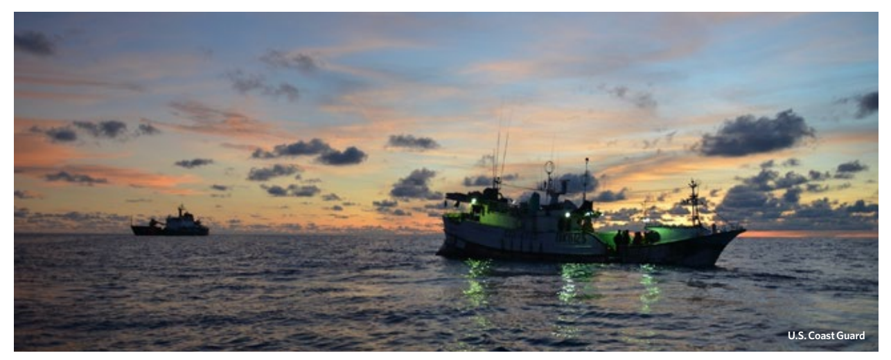
A fisheries enforcement ship (on left) waits as authorities board a vessel observed fishing in national waters in the Philippine Sea. Vessel monitoring systems help track licensed fishing vessels to make it easier to conduct boardings at sea to ensure compliance with fisheries regulations.