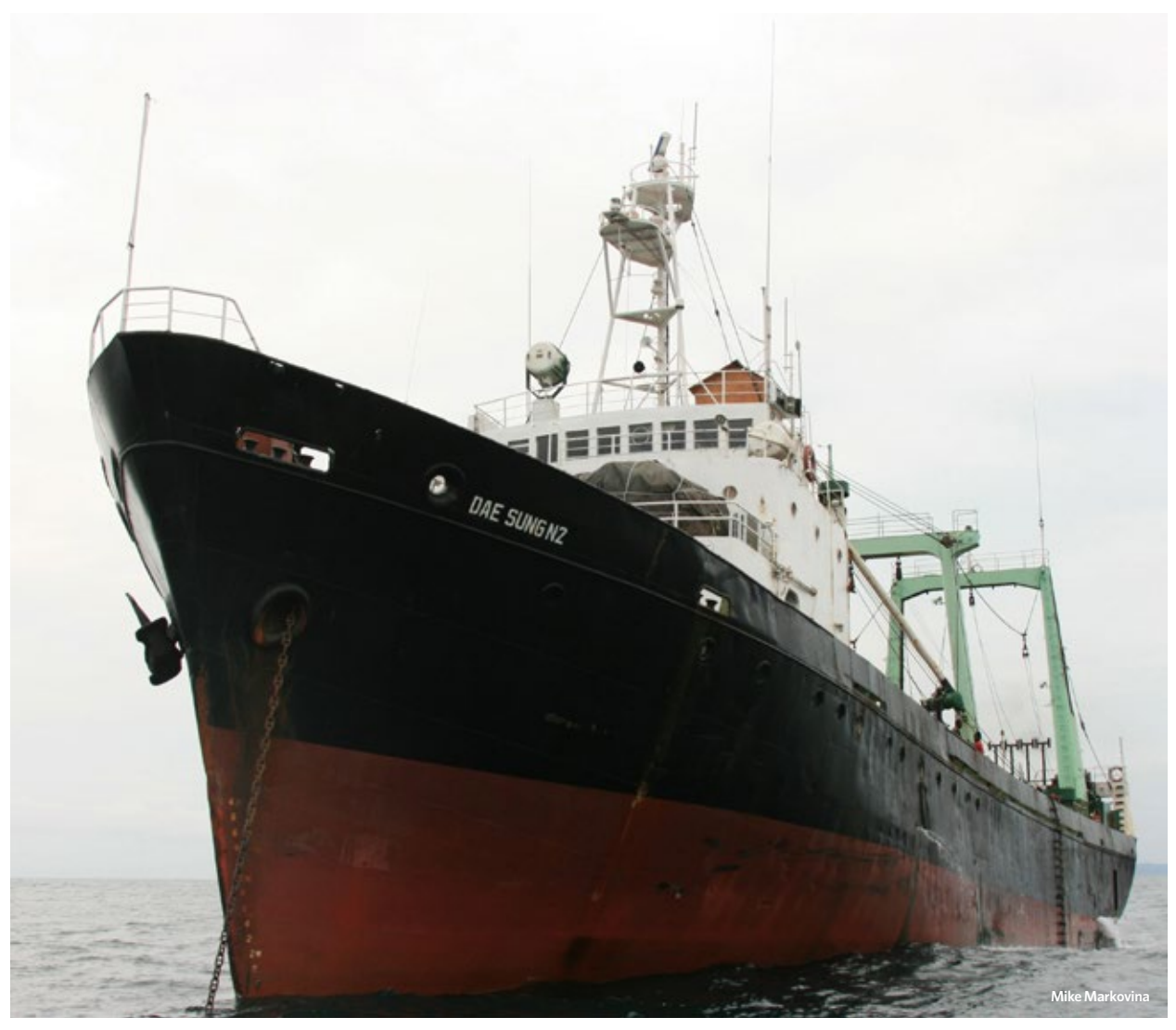
Fisheries management authorities use data from vessel monitoring systems to document the movements and activities of vessels within national maritime zones to make sure they are fishing legally.