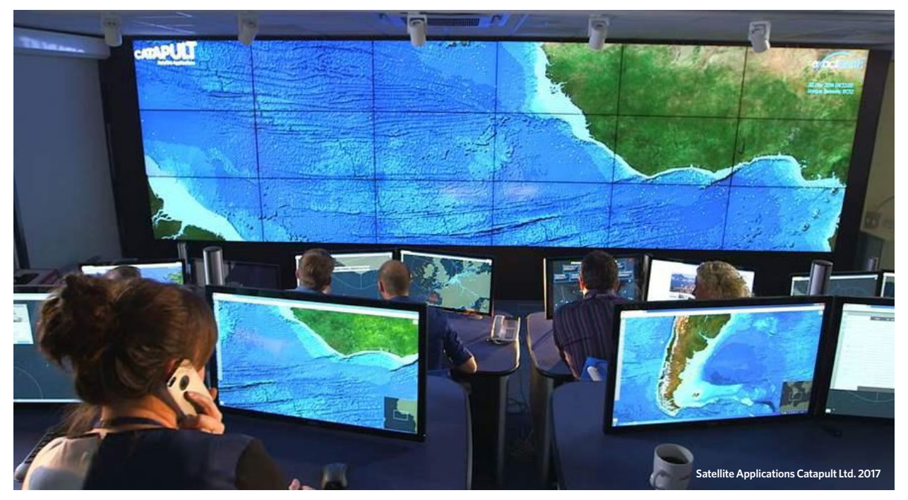
Using state-of-the art systems that integrate multiple sources of information, analysts at fisheries monitoring centers can scan vessel monitoring system data to track the movements and activities of fishing vessels.

VMS transmissions should be provided to authorities in near-real time. Vessels should transmit VMS data at the highest possible frequency, ideally at hourly intervals. Higher reporting rates permit more accurate monitoring of fishing or transshipment operations and, when correlated with catch data, helps improve scientific stock assessments. Authorities must recognize that there will be a degree of delay or latency between the time a VMS data report is transmitted from a vessel to the point it is displayed on a user interface within an FMC. In most cases, when a VMS is performing correctly, data latency should be less than one hour for at least 90 percent of position data.