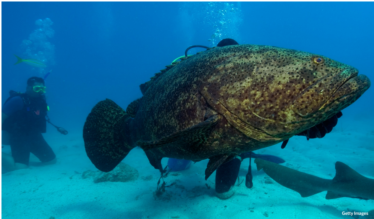
Goliath grouper can weigh as much as 800 pounds and grow up to 8 feet long.

The Magnuson-Stevens Act should be strengthened to minimize bycatch nationwide. In doing so, we have a chance to harness American ingenuity to catch the species fishermen want and leave the rest in the ocean.