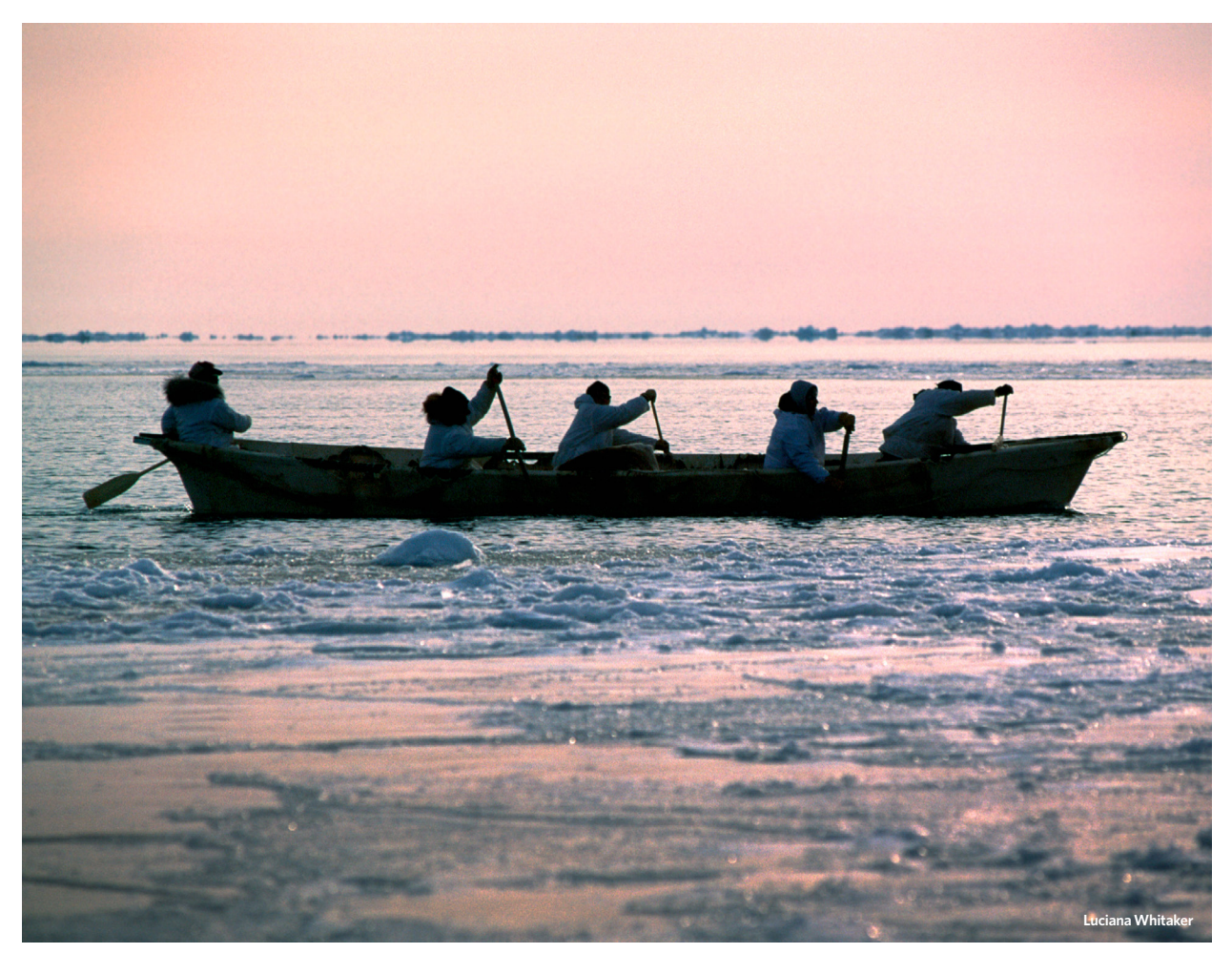
Arctic Ocean wildlife sustain the Inupiat people's subsistence activities, which have been key to their nutritional, cultural, and spiritual wellbeing for thousands of years.