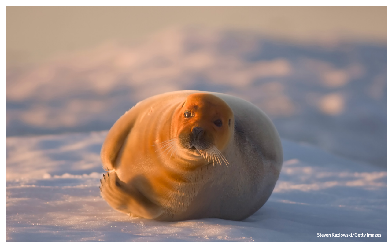
Bearded seals are common in shallow Arctic waters. High concentrations of these seals assemble in the nearshore Chukchi Coastal Buffer, where they give birth to pups in spring.

water) in the otherwise pervasive sea ice. These openings let in sunlight for algae to grow, providing energy for tiny floating animals such as plankton, and offer places for mammals to breathe. During the annual spring and early summer migration from the Bering Sea to the Arctic Ocean, they offer a passage through which almost the entire population of the western Arctic stock of bowhead whales, as well as beluga and gray whales, ice seals, waterfowl, gulls, seabirds, and other wildlife, transit north.