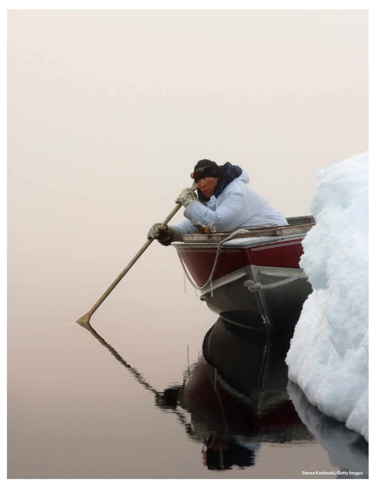
An Inupiat hunter uses a wooden oar to listen for passing bowheads during the spring whaling season in the Chukchi Sea.