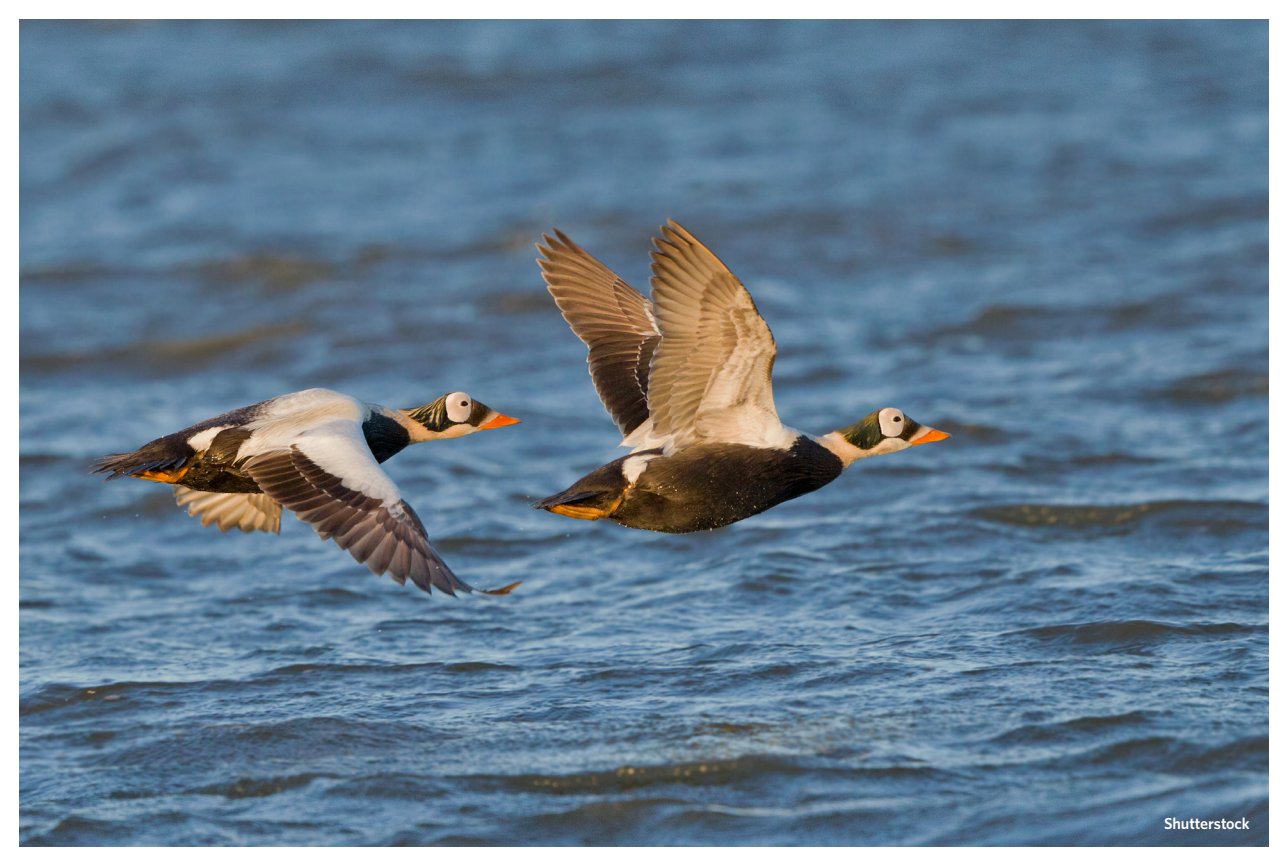
A pair of spectacled eider drakes fly over the coastal waters of Barrow, Alaska. Millions of seabirds migrate annually across long stretches of the Arctic Ocean, using marine habitat to feed, rest, and breed.