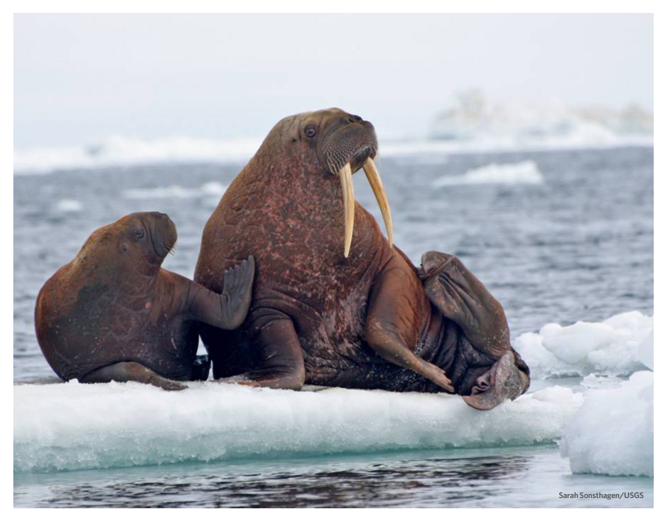
Areas like Hanna Shoal in the Chukchi Sea are essential habitat for walruses, which rest in family groups between foraging and migrating.