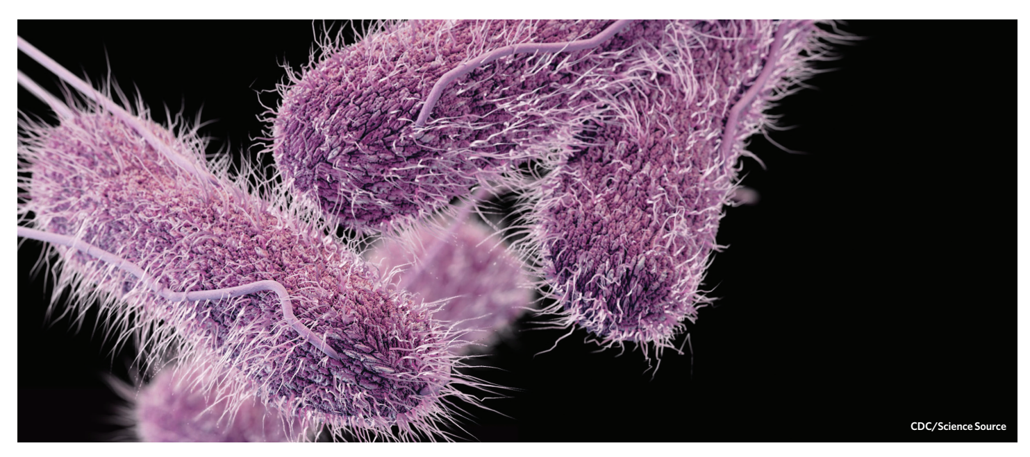
A drug-resistant strain of Salmonella as viewed through a microscope.