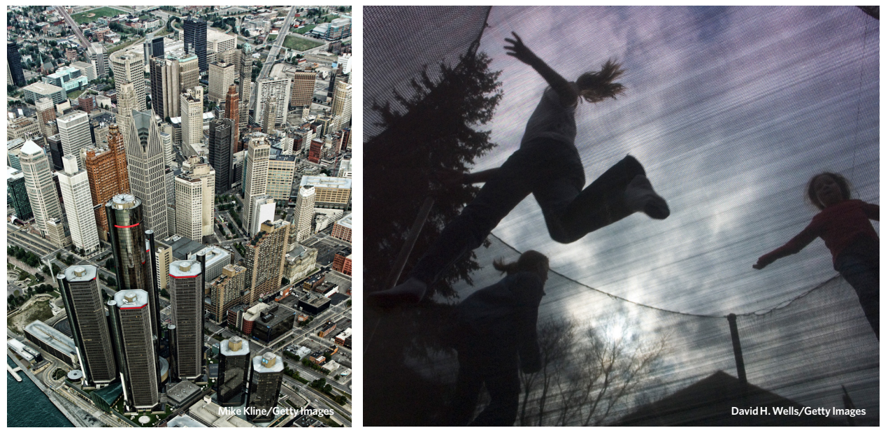
Left: A bird's-eye view of Detroit. Right: Children jumping on a trampoline in Detroit.

Contrast Vallejo with Central Falls. In March 2014, less than two years after Central Falls emerged from bankruptcy, city officials reported a budget surplus for fiscal 2013.<sup>23</sup> To carry out the city's six-year recovery plan, Rhode Island returned control of daily operations to elected municipal officials while retaining oversight of city finances. The bankruptcy court maintains the authority to intervene to enforce or change the recovery plan if the judge believes that the city is mismanaging its finances.