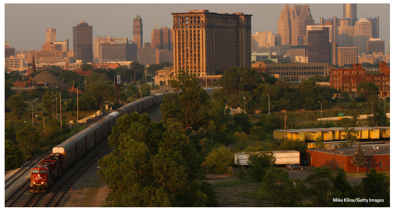
A freight train in Detroit with the Renaissance Center and Central Depot in the background.

The biggest differences among states that monitor local government finances are in what they do with the data after they are reported. Some only observe. Washington state posts each city's financial profile on a website but has no formal program to intervene if the fiscal indictors demonstrate distress. Illinois requires local governments to submit annual financial reports for analysis but leaves it up to local officials to ask for assistance.<sup>29</sup>