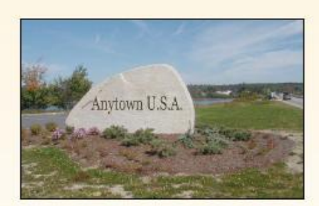
"GATEWAY" SIGNS let drivers know they are leaving a rural highway and entering a community.