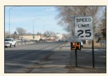
SPEED FEEDBACK SIGNS tell drivers their speed (measured by radar) and the speed limit on the road.

Changes to U.S. 550 can make it safer and more inviting. There are different ways to slow traffic, to shorten the distance for people crossing the street, and to make it easier for drivers to see the people trying to cross the street. Here are some ways to "calm" or slow traffic down: