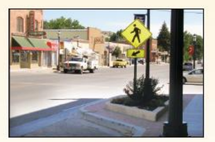
BULB-OUTS, OR EXTENSIONS of the sidewalk at either end of a crosswalk, make the distance people have to cross shorter and make it easier for drivers to see the people trying to cross the street.