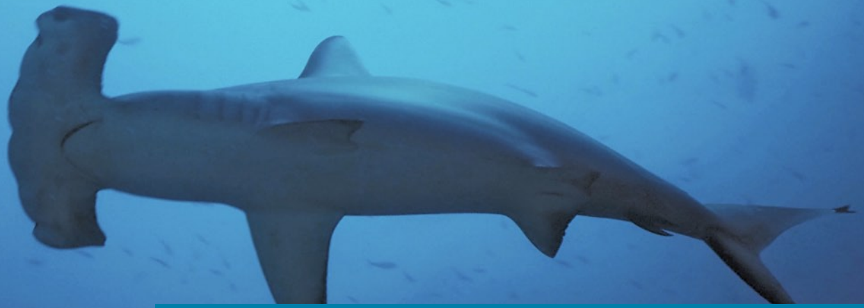
TABLE 2: PERCENT CHANGE IN SHARK ABUNDANCE AND BIOMASS OVER TIME ACROSS ALL STUDY SITES IN THE MEDITERRANEAN SEA