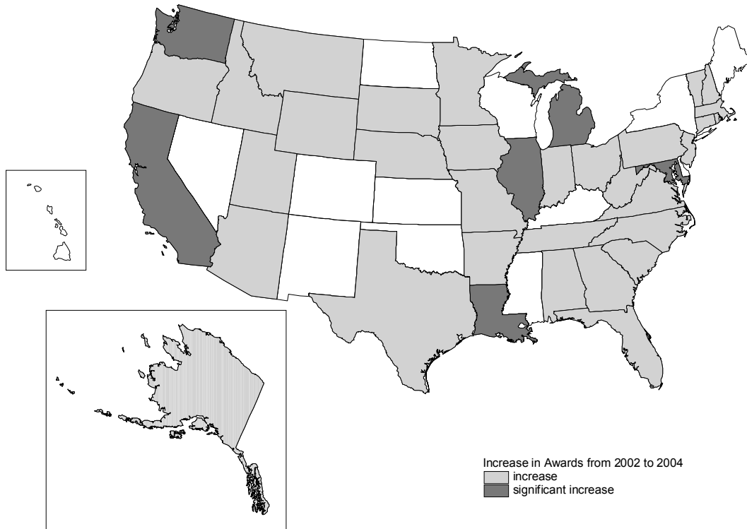
Figure 2. States with Increases in the Number of Awards to FBOs from 2002 to 2004