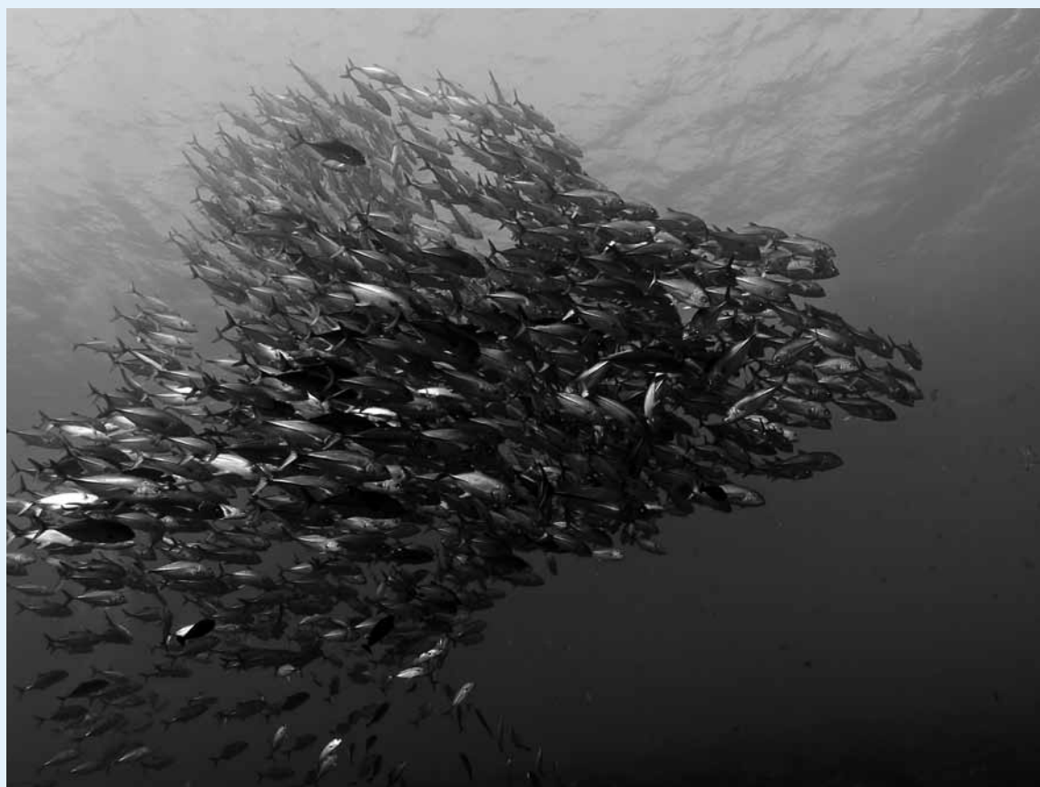
Biodiversity of Rangiroa atoll, © Pommeyrol Vincent/Shutterstock

Global fisheries are widely regarded as overcapitalized, a reality that contributes significantly to the depletion of fisheries. 55 Some studies estimate fisheries subsidies to total US$ 25-30 billion annually. 56 Economists have estimated that society at large currently receives negative US$26 billion a year from fishing. 57 US$152 million is spent every year to support deep sea fisheries alone. 58 Without government support, these operations would operate at a loss of US$50 million a year. 59 A startling example of the negative effects of harmful subsidies concerns deep sea fisheries. Global deep sea catch is in steady decline and the high vulnerability of deep-sea fish populations and diverse marine ecosystems is well documented. 60 In the Northeast Atlantic, scientific authorities have determined that 100% of all targeted deep-sea species are “outside safe biological limits.” 61 Despite this knowledge, destructive deep sea fishing operations continue to be supported by government subsidies in the midst of a global financial crisis. A communication from the European Commission distributed at ICP in 2011 emphasized the importance of tackling harmful subsidies and highlighted the G20 commitment to rationalize and phase out inefficient fossil fuel subsidies that encourage wasteful consumption. 62 Numerous States have asserted that addressing harmful fisheries subsidies is absolutely critical to chart a path for sustainable development. 63