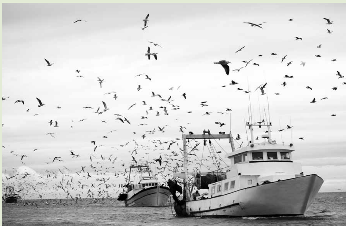
Trawler surrounded by seagulls under covered sky

This target is found both within the JPOI 84 and the Millennium Development Goals (MDGs). 85 Biodiversity is vitally important for human well-being, because it underpins the ecosystem services on which life depends. Not only do billions of people rely on a myriad of species for their livelihoods and survival, but the loss of biodiversity will hinder the delivery of the MDG targets related to poverty, hunger and health, since it will increase the vulnerability of the poor and reduce options for development. 86 The 2010 MDGs Report 87 noted that the world has missed the 2010 target for biodiversity conservation, with potentially grave consequences. 88 In particular, the specific indicators agreed for the MDG goal -- the proportion of fish stocks within safe biological limits, the proportion of terrestrial and marine areas protected and the proportion of species threatened with extinction 89 – shows by how far this goal has been missed.