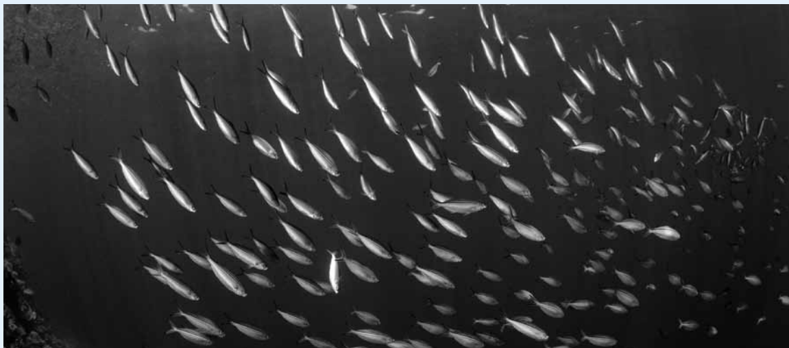
School of Fusilier Fish, © Rich Carey/Shutterstock

Principle 2: "States have, in accordance with the Charter of the United Nations and the principles of international law, the sovereign right to exploit their own resources pursuant to their own environmental and developmental policies, and the responsibility to ensure that activities within their jurisdiction or control do not cause damage to the environment of other States or of areas beyond the limits of national jurisdiction."