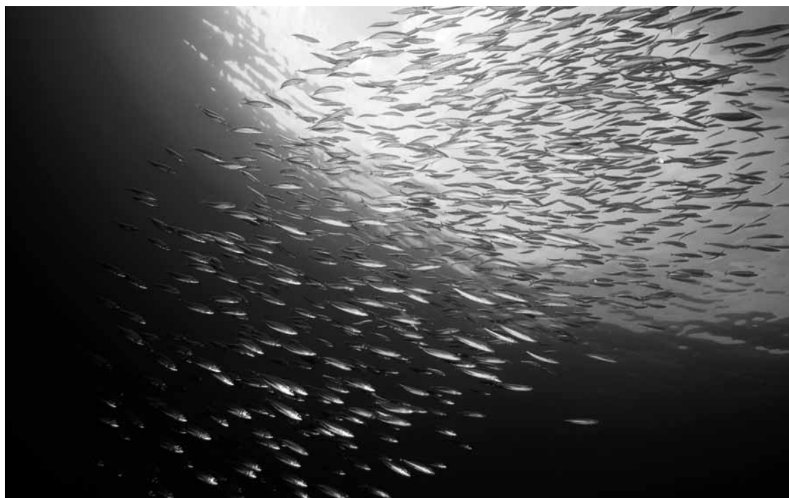
Shoal of Mackerel Fish

The UNCSD preparatory process will discuss and refine two distinct themes, 1) a green economy in the context of sustainable development and poverty eradication and 2) the institutional framework for sustainable development.