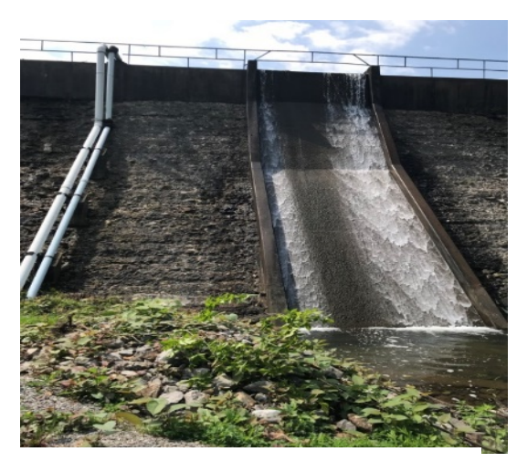
Elkhorn Dam Spillway

Since 1912, the dam has deteriorated, with seepage from the dam face constant and increasing. At the time the dam was constructed, the coal company likely did not know that the dam was in an earthquake zone with an earthquake fault running directly through the dam. Since the Elkhorn Lake Dam's construction, there have been over 800 of small earthquakes around Kentucky which have increased to Richter 4.6 and the dam seepage has increased tenfold but has not vet caused a breach. The Kentucky Division of Dam Safety has rated Elkhorn Lake as a High Hazard dam in Poor condition. constructed, the dam's design called for pipes to penetrate the base and a spillway at the top of the dam to release pressure on the dam during flood conditions. Over time, these efforts have diminished to control hydrologic pressure. Overtopping is a condition attributable to a large share of dam failures worldwide. Any