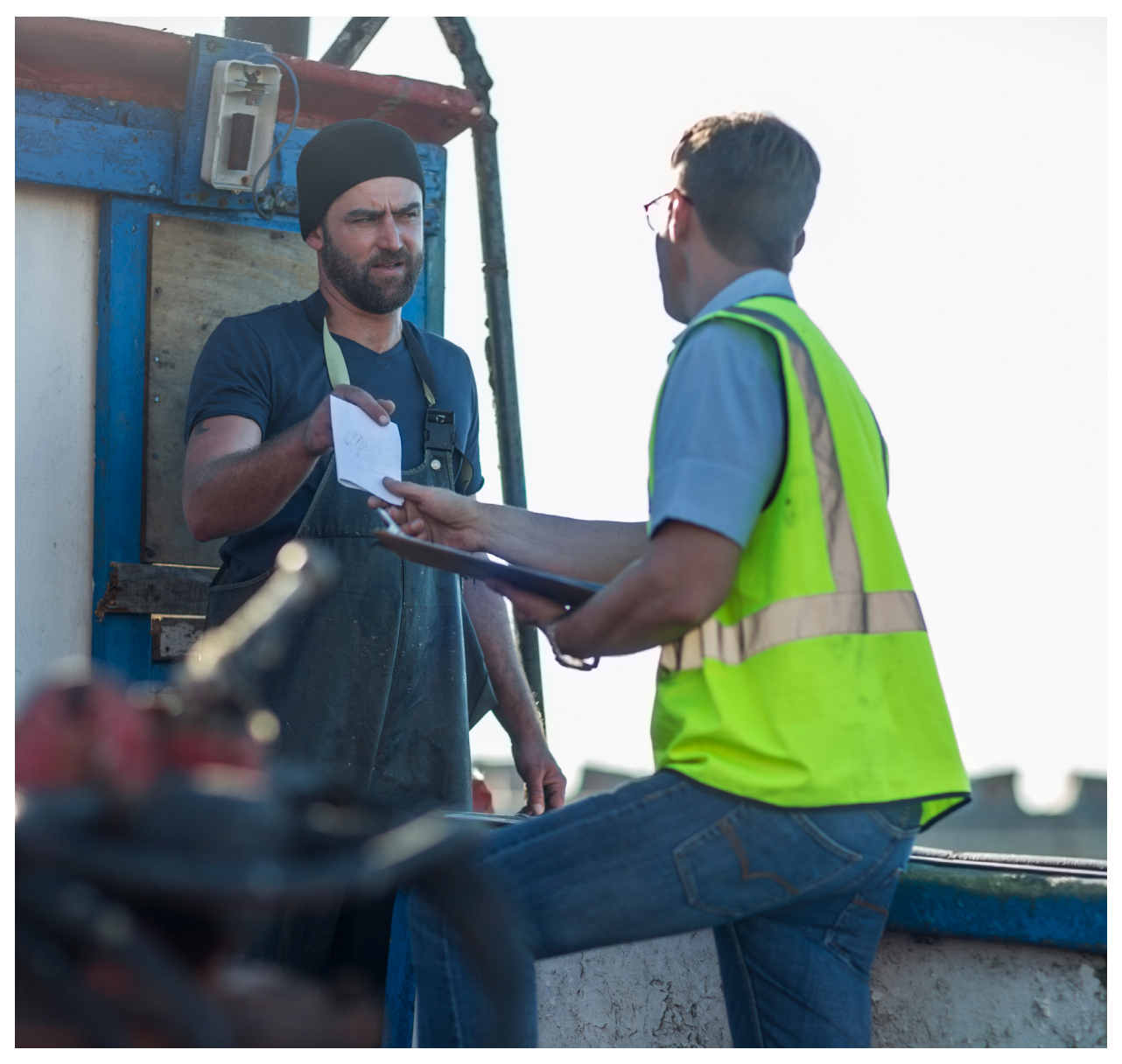
A fisher and an inspector speak on the deck of a trawler.