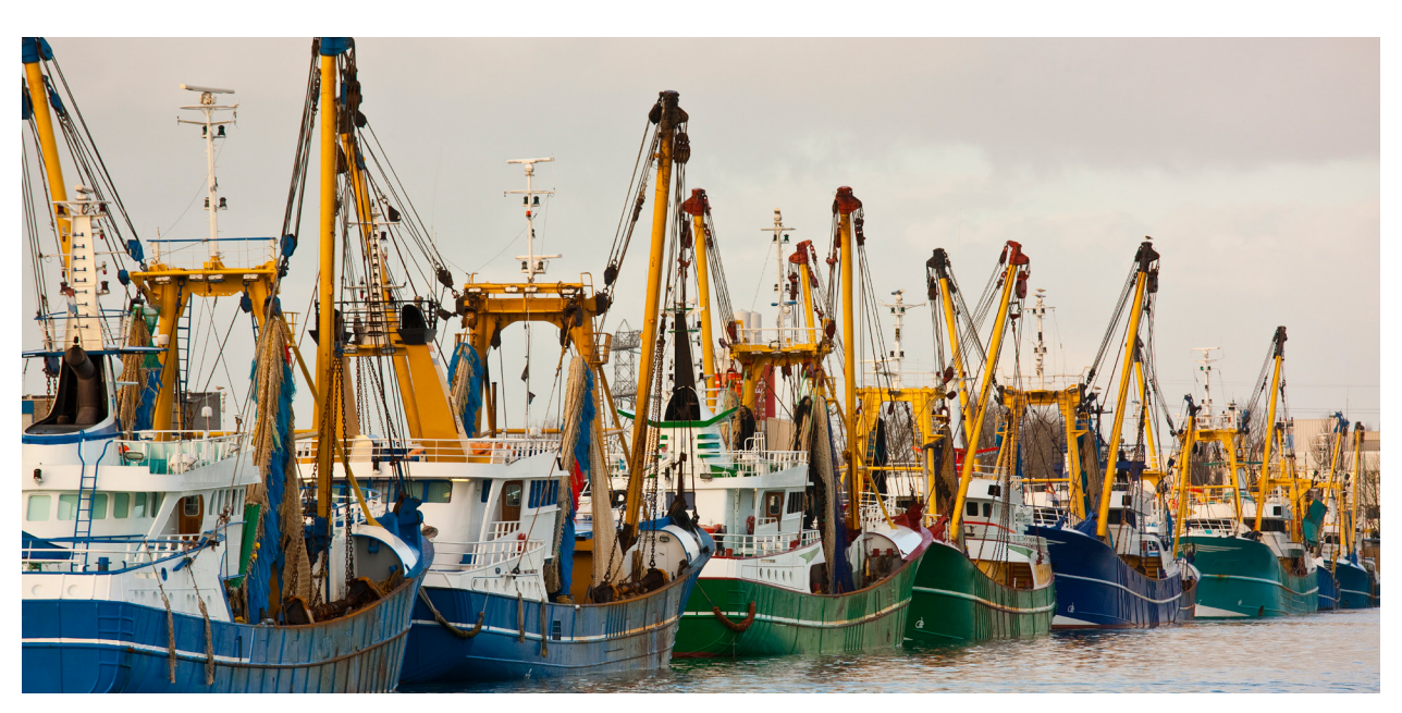
A trawler fleet is docked at a pier in Middelburg, a port in the Netherlands.