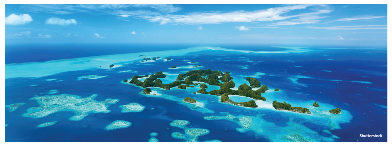
The Rock Islands, a UNESCO World Heritage site, include 445 uninhabited limestone islands of volcanic origin.