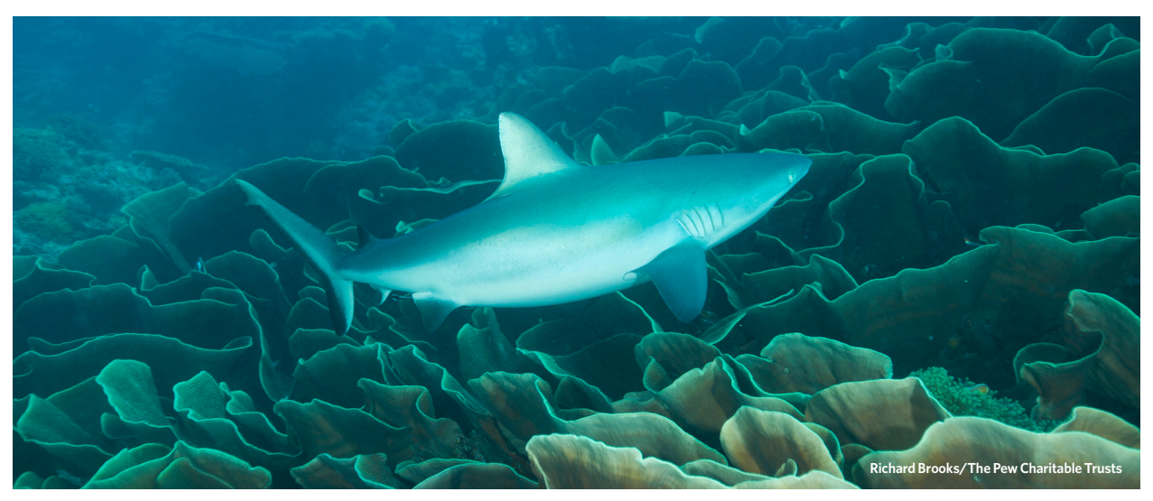
In 2009, Palau created the world's first shark sanctuary.