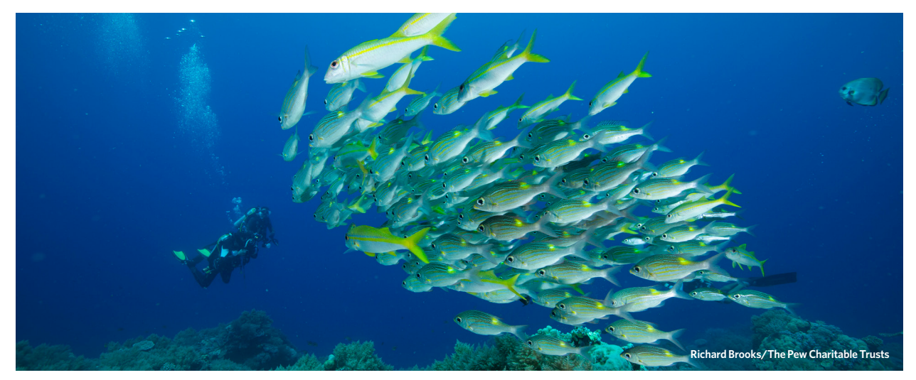
Diving generates about $90 million a year for Palau's economy.

To ensure the sustainability and feasibility of this massive endeavor, the sanctuary will be phased in over a five-year period. A separate zone reserved for local fishermen and small-scale commercial fisheries with limited exports will cover the remainder of Palau's waters. Coastal waters from shore to 22 kilometers (12 nautical miles) will not be affected and will be managed under current regulations.