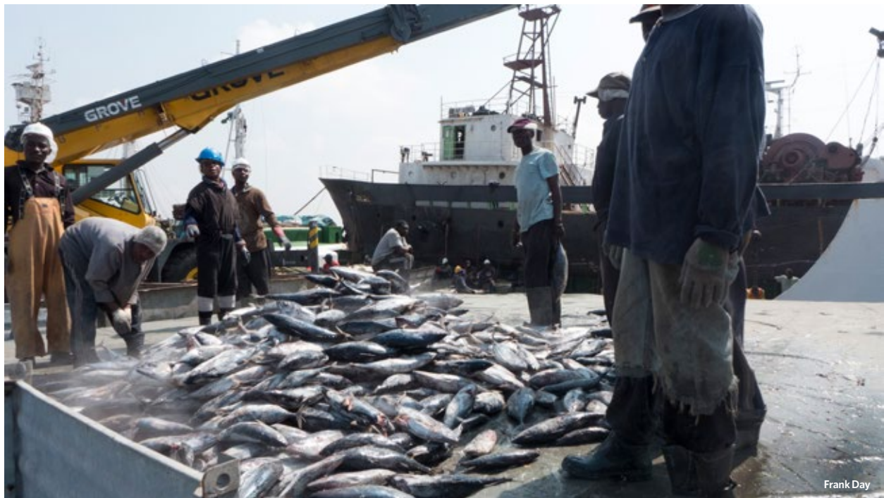
Fishermen sort catch at the port of Tema, Ghana. While there are no indications this crew was operating illegally, Ghana is among many developing countries that are hard hit by large-scale illegal fishing.

In cooperation with the New Partnership for Africa's Development (NEPAD), through its Stop Illegal Fishing (SIF) Working Group, and six African countries, 1 Pew has supported the development of a capacity needs assessment (CNA) methodology, part of a set of tools that we have committed to help develop to ensure that States have the necessary instruments to effectively implement the PSMA and can move quickly towards closing all ports to vessels engaged in illegal, unreported and unregulated (IUU) fishing.