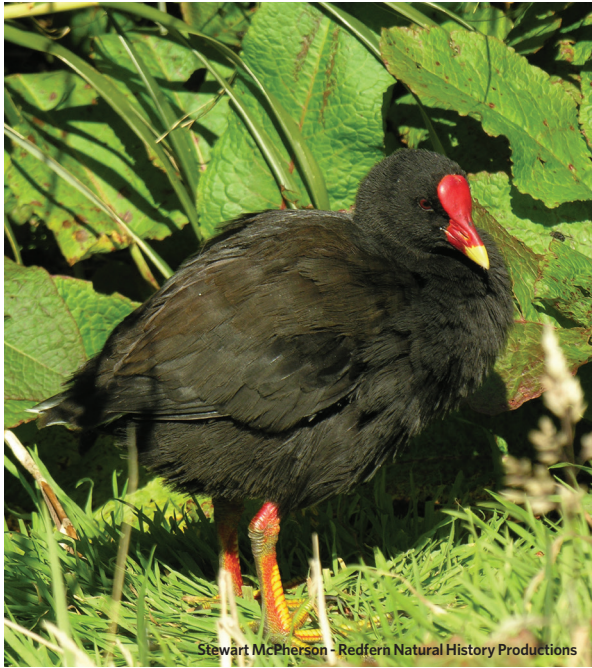
The Gough moorhen is an almost flightless bird that is restricted to Tristan da Cunha and Gough Island.