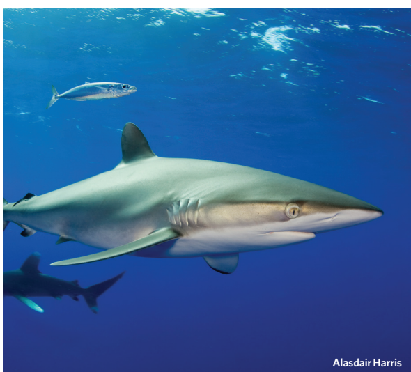
Large marine reserves, such as the Chagos Marine Reserve in BIOT, protect migratory species such as silky sharks.

Through the Chagos Environment Network's 'Protect Chagos' campaign, The Pew Charitable Trusts' Global Ocean Legacy team played a leading role in protecting the waters of the BIOT, through working with government to secure what was, at the time, the largest fully protected marine reserve in the world.