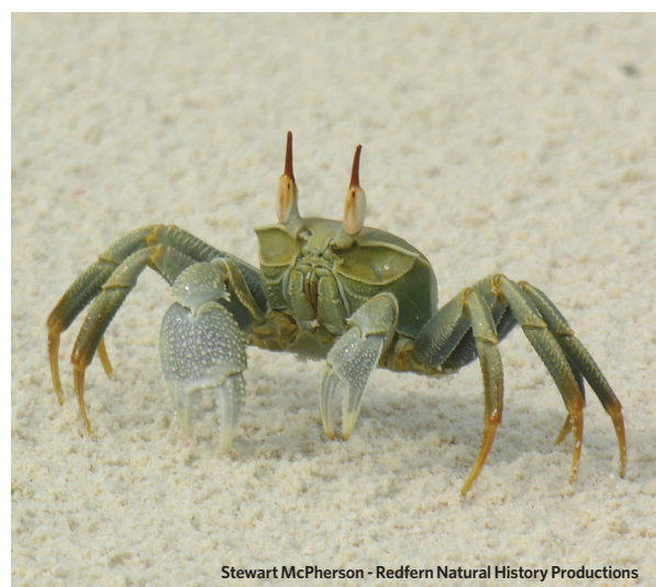
The Chagos archipelago hosts many crab species, including the ghost crab.