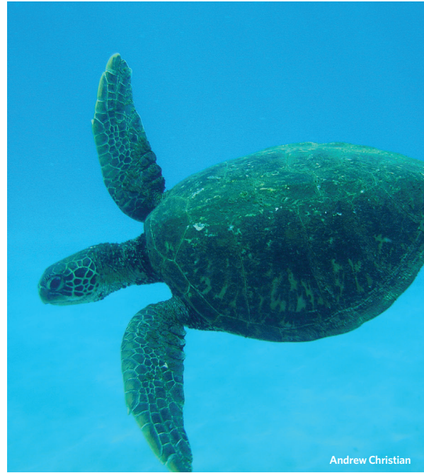
A green sea turtle swimming in the rich waters surrounding the Pitcairn Islands.