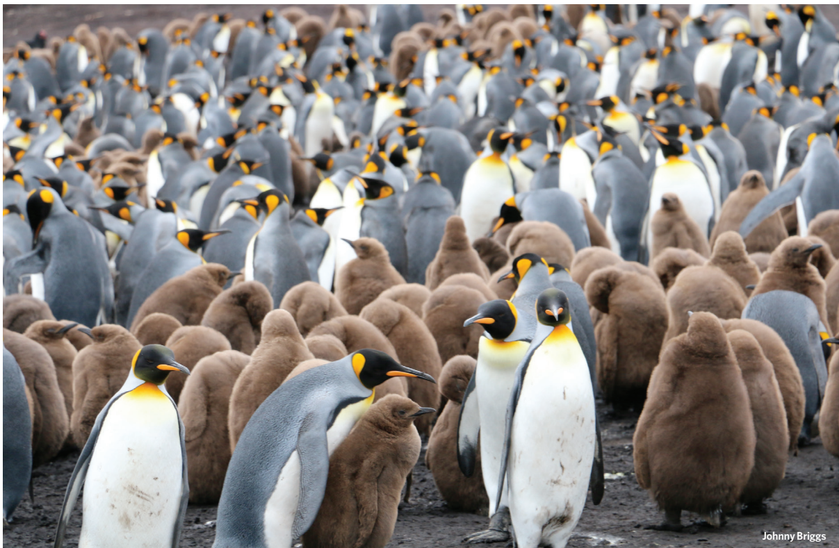
Gold Harbour in South Georgia is a major breeding ground for penguins.

Pew's Global Ocean Legacy U.K. team collaborates with island communities and partners in efforts to conserve the biodiversity and marine life of the overseas territories. GOL supported creation of the Pitcairn Islands Marine Reserve and the Chagos Marine Reserve and is exploring better protections for the overseas territories of South Georgia and the South Sandwich Islands and Tristan da Cunha.