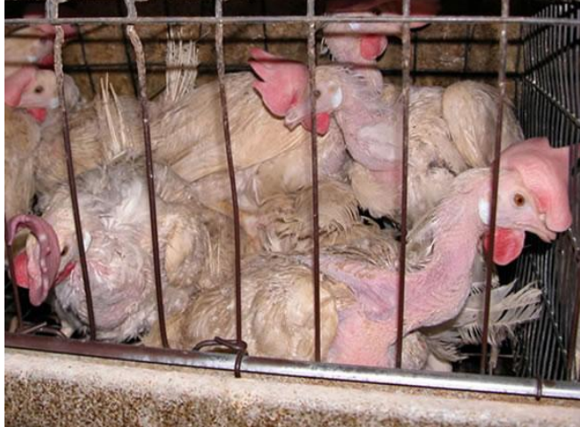
Industrialized broiler housing