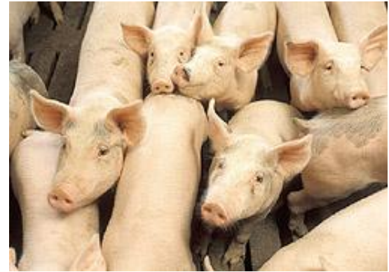
Industrialized hog production

Because there are currently minimal regulations requiring drug manufacturers or food animal producers to report how antibiotics are marketed and used in food animal production, the scale of antibiotic use in food animals is unknown. Estimates vary greatly on the amount of antibiotics fed to farm animals, but between 30 to 70 percent of all antibiotics and related drugs sold in the U.S.<sup>iii</sup>