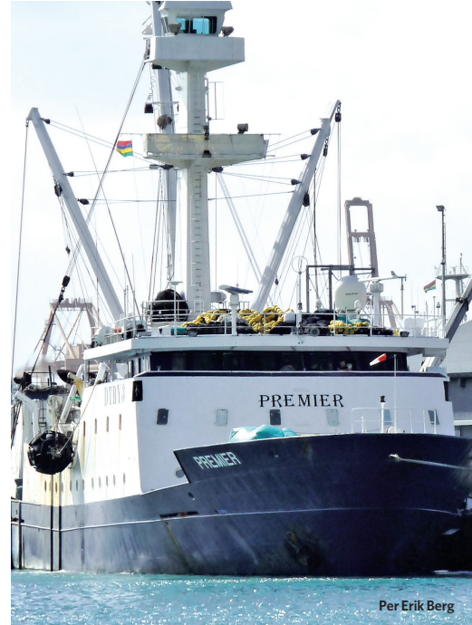
The Spanish-owned Txori Argi, left, was fined $1.2 million in 2012 for illegally fishing for tuna in Mozambique's waters. The South Koreanowned Premier was fined $1 million in 2013 for forging a license to fish for tuna in Liberian waters.