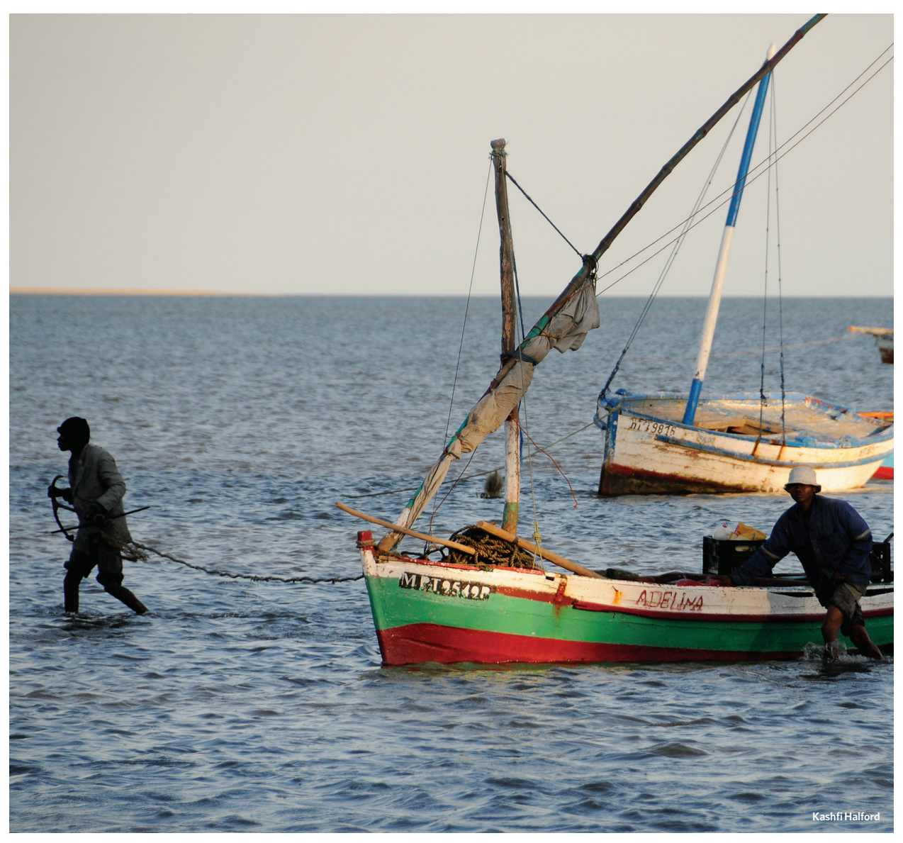
Artisanal fishers in many parts of the world are reporting declining catches, in part because of depletion of fish populations by illegal, unreported, and unregulated fishing.