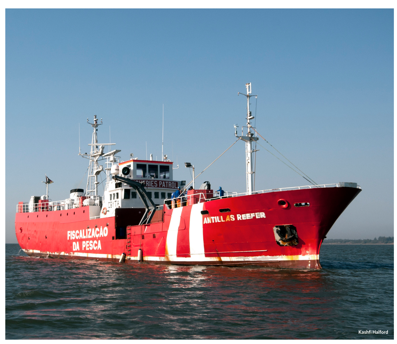
Authorities confiscated the Antillas Reefer in August 2008 after an investigation revealed it had been fishing illegally in Mozambique's waters. The ship was converted to a patrol vessel and now polices fishing off the coast of southeast Africa.