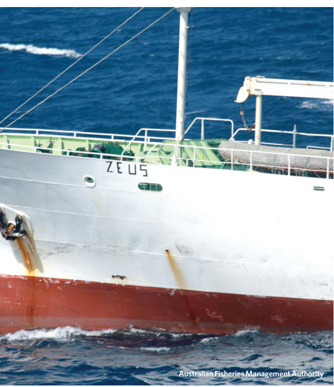
Crew members on a vessel suspected of illegal fishing paint a new name on the hull as Australian authorities approach for an inspection in the Southern Ocean in 2011. The vessel has had numerous names throughout its history, including Zeus, Lana, and Triton, and its flag has been revoked by Togo for illegal fishing offenses.