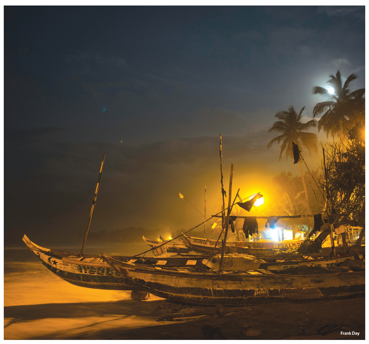
Artisanal fishing canoes await launch in Kokobrite, Ghana. The catch of some near-shore species in Ghana has declined drastically in recent years, in part because of illegal fishing incursions by industrial trawlers.

When this IUU fishing depletes fish stocks and forces regulators to reduce catch limits, legitimate fishermen who follow the rules designed to preserve the health of the marine environment bear the burden.