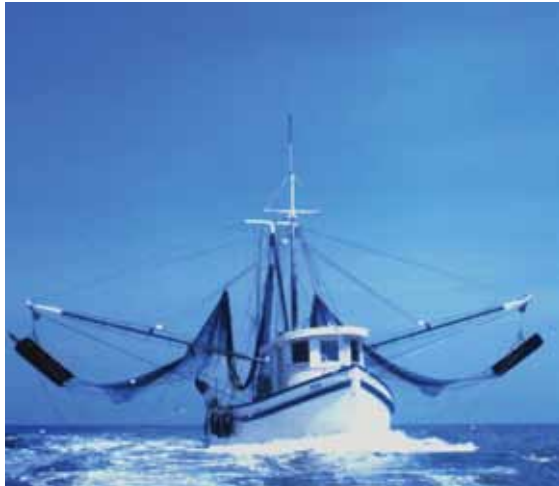
DOUBLE-RIGGED SHRIMP TRAWLER OFF THE COAST OF BRUNSWICK, GA., IN 1968.