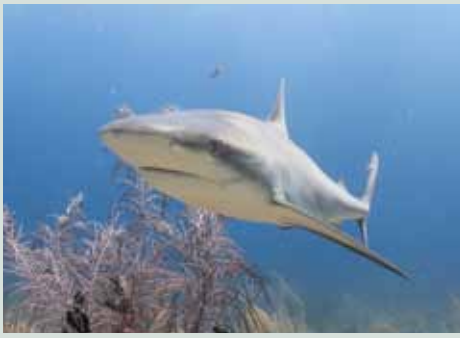
C/O STUART COVERS DIVE BAHAMAS