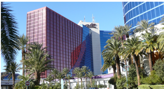
Rio Las Vegas

The Rio is home to the first CHP system on the Las Vegas Strip. Installed in 2004, the 4.9-MW system generates 40 percent of the electricity, 60 percent of the hot water and 65 percent of the heat needed by the hotel-casino. 5 The efficient combination of on-site heat and power generation reduces the property's annual energy bill by about $750,000, resulting in a positive return on investment for the project. These savings are reflected in lower electric bills for the property. Heat recovered from the generator stacks and engine jackets, combined