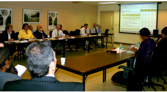
Real-time comparative performance data is displayed at a NYC Probation STARS meeting.