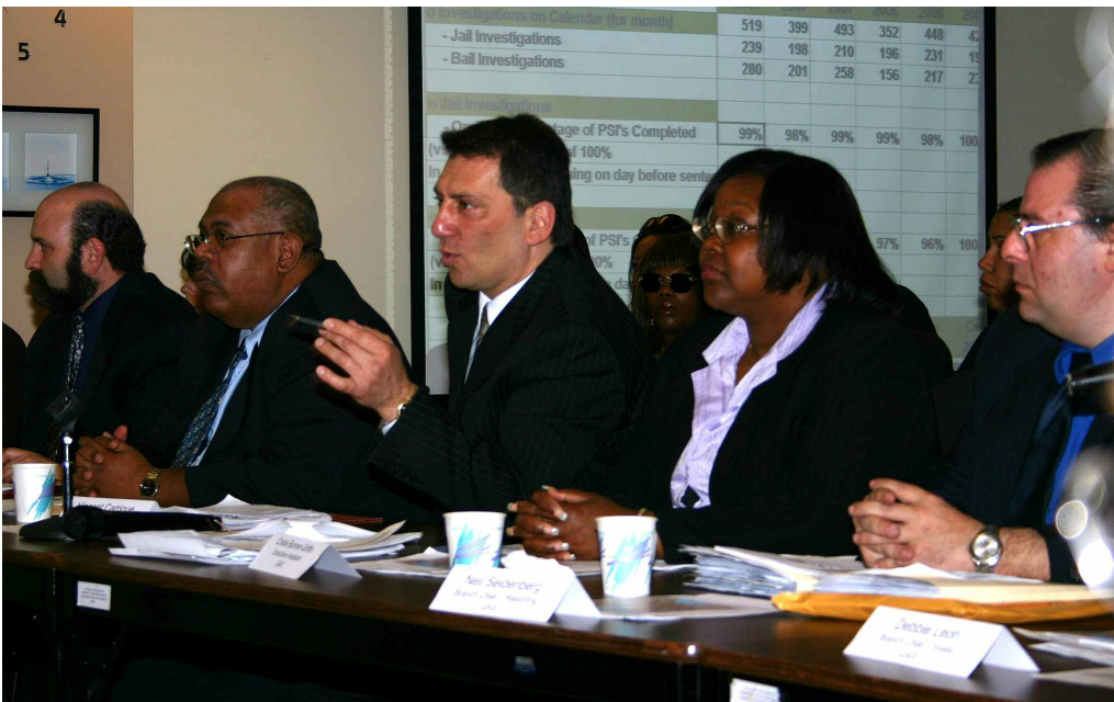
New York City Probation is one of the first community corrections agencies to adapt Compstat.

Policy makers probably receive higher quality performance reports from many agencies, including others in the criminal justice system. Beginning in earnest with the publication of Reinventing Government 3 in 1992 and