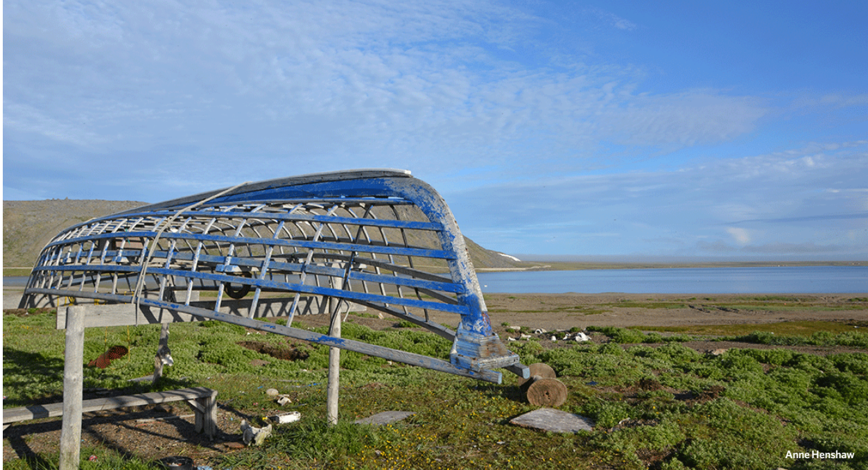
The wooden frame of a skin-covered boat on St. Lawrence Island: Traditional knowledge provides a basis for traveling and hunting safely.

western Alaska, elders began talking about beavers. The connection was not clear to the researcher until one of the elders pointed out that the local beaver population was increasing, leading to more beaver dams and affecting the spawning habitat of fish that belugas ate in the bay. 7 Although few biologists have the opportunity to study both on land and in the ocean, hunters often spend time in all parts of their landscape and thus may recognize connections such as that between beavers and belugas.