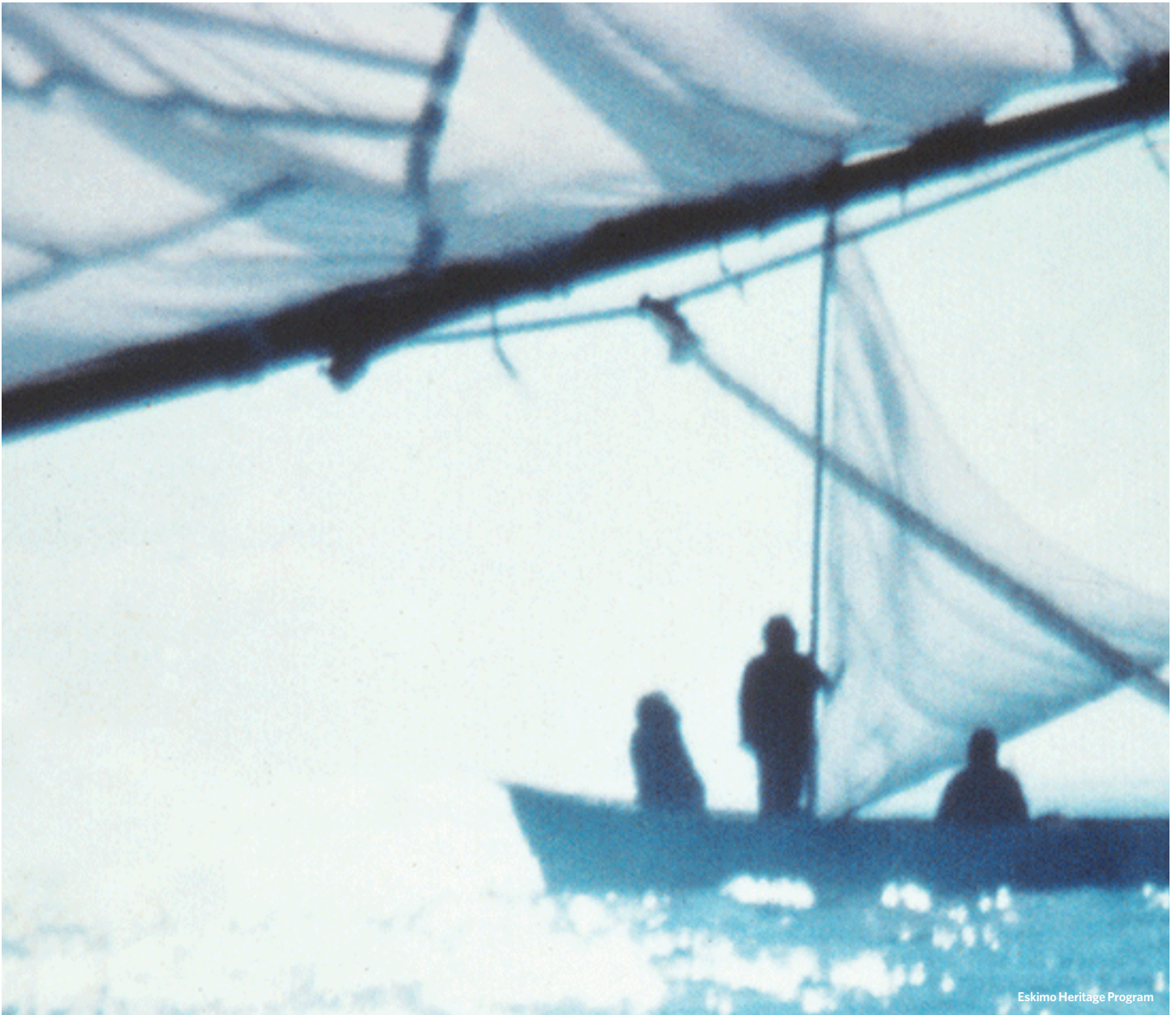
Eskimo Heritage Program