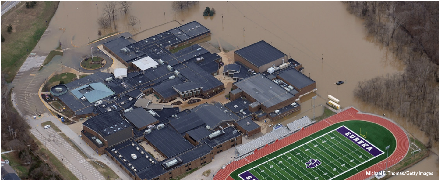
Floodwater approaches the campus of Missouri's Eureka High School in December 2015. The school sustained $2.5 million in damage.