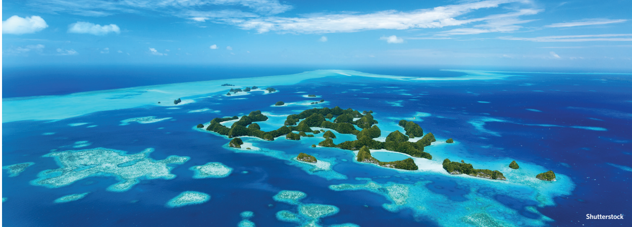
The Rock Islands, a UNESCO World Heritage site, include 445 uninhabited limestone islands of volcanic origin.