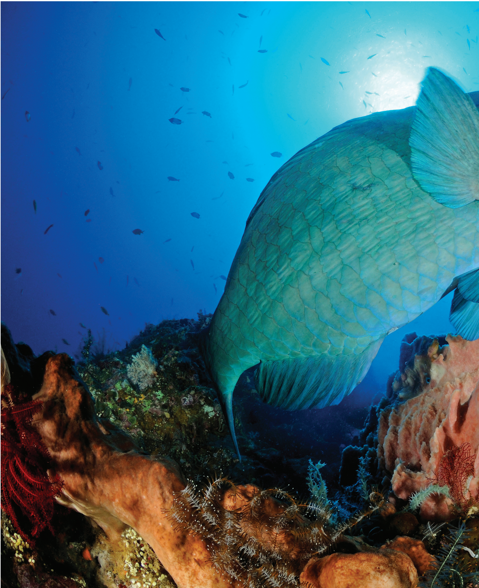
In 1994, the same year Palau became independent, it passed the Marine Protection Act, which included a moratorium on fishing for bumphead parrotfish.