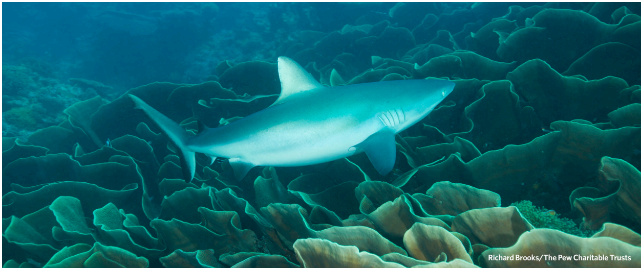
In 2009, Palau created the world's first shark sanctuary.