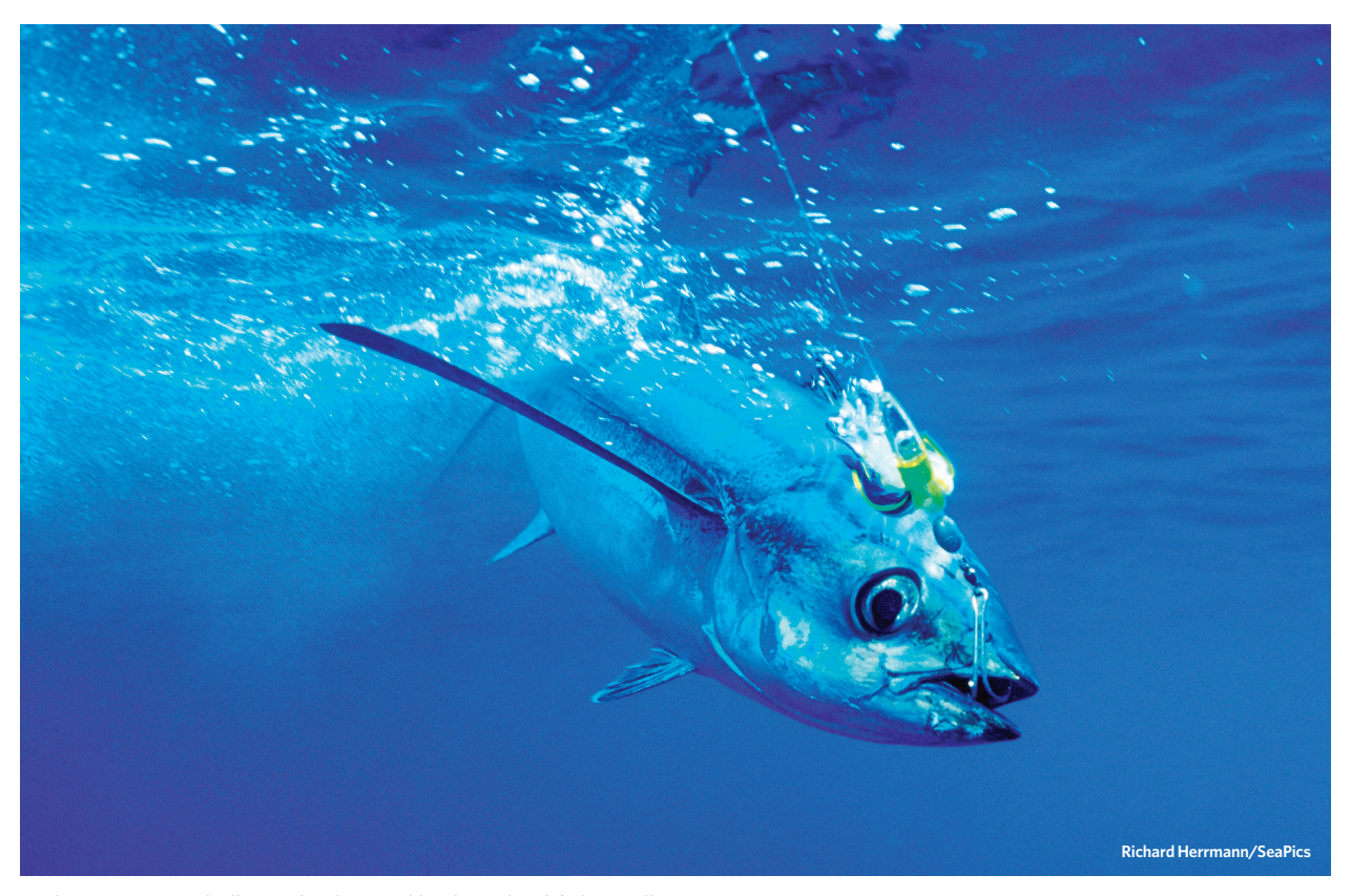
Nothing is quite as thrilling as hooking and landing a hard-fighting albacore tuna.

Policymakers in Washington can also help conserve forage fish—and the larger marine animals that prey upon them—by modernizing the Magnuson-Stevens Fishery Conservation and Management Act, the primary law governing management of U.S. ocean fish. In the revisions, Congress should require all regional fishery management councils to establish science-based limits on how many forage fish can be caught each year and to account for the important role the small species play in feeding other ocean wildlife.