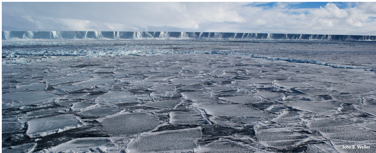
John B. Weller

This approach for the design of marine protected areas is common for places where data are limited, such as the waters off East Antarctica. Consensus on these conservation measures would ensure that valuable marine habitat remains intact.