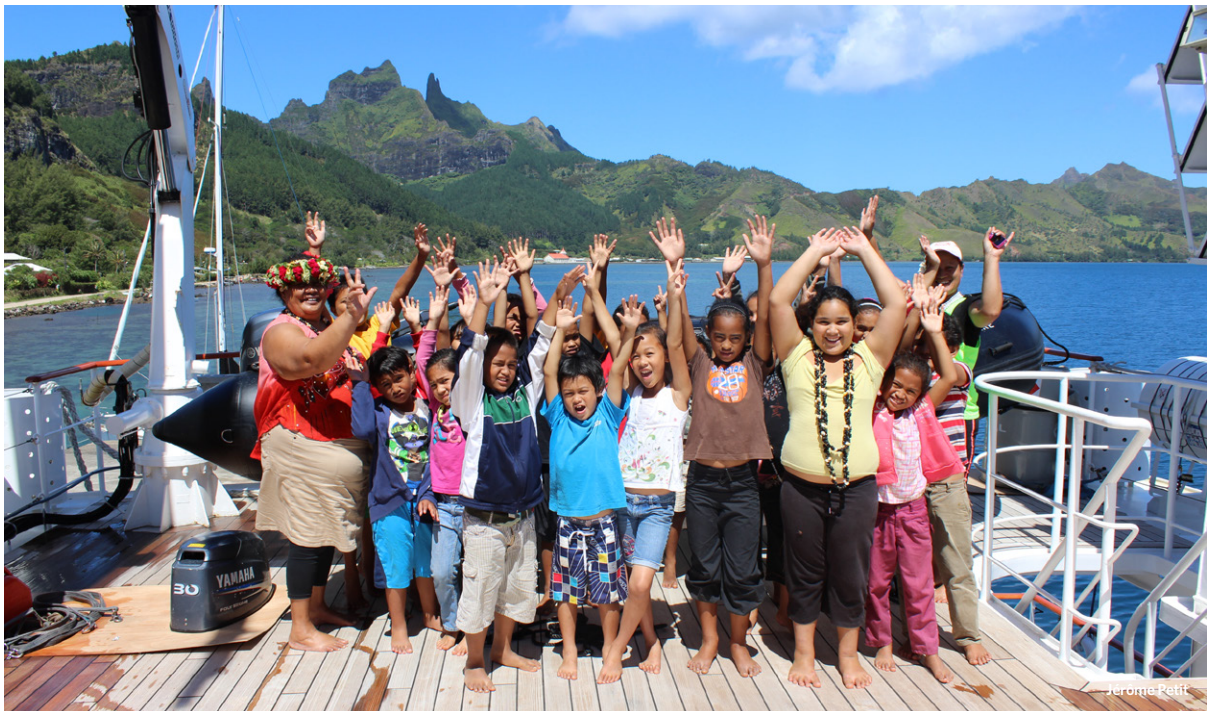
Students from Rapa during an Ocean Day event.

The 2014 scientific expeditions to Rapa and Marotiri confirmed the high level of endemic flora and fauna, but a precise measure of the archipelago's full richness awaits further exploration of the marine environment of the five northern islands and the 42 underwater seamounts. What scientists have learned to this point, however, testifies to the unique and rich biodiversity in these waters. In addition, the relative isolation of the southern archipelago, the number of unique species, and their level of preservation makes this a valuable site to observe the impacts of a changing climate.