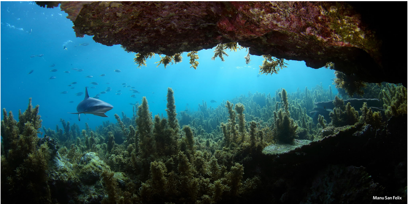
Manu San Felix

The underwater marine ecosystem off Rapa, one of the Austral Islands.