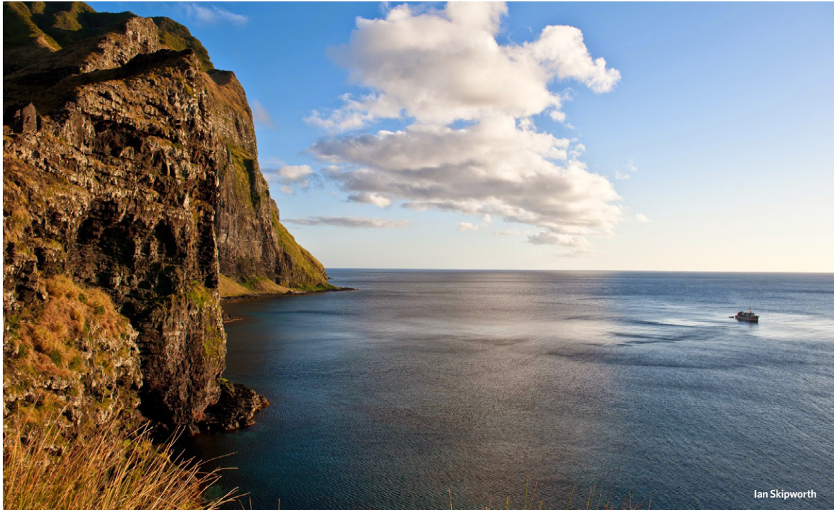
Cliffs in Rapa.

Among the conclusions are that conservation of Rapa and Marotiri must be top priorities because of the nature and uniqueness of the species found there—on land, in the air, and in the water.