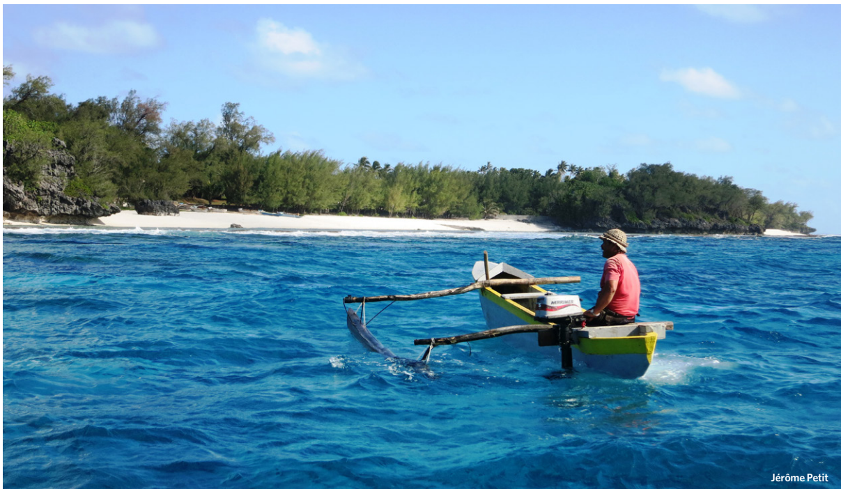
Local fisherman in a traditional canoe off Rimatara.

The ethnological studies undertaken by CRIOBE, the Department of Culture and Heritage, the IRD (Institut de Recherche pour le Développement), and Pew confirm the richness of the Australs' cultural heritage and the importance of the relationship between the people and the ocean (Moana). The findings also affirm traditions that call for local populations to play a role in facing the challenges associated with preservation (paruru) of their ocean. The research underscores the need to better understand the links among these traditions and those of different island groups, most notably the Cook Islands.