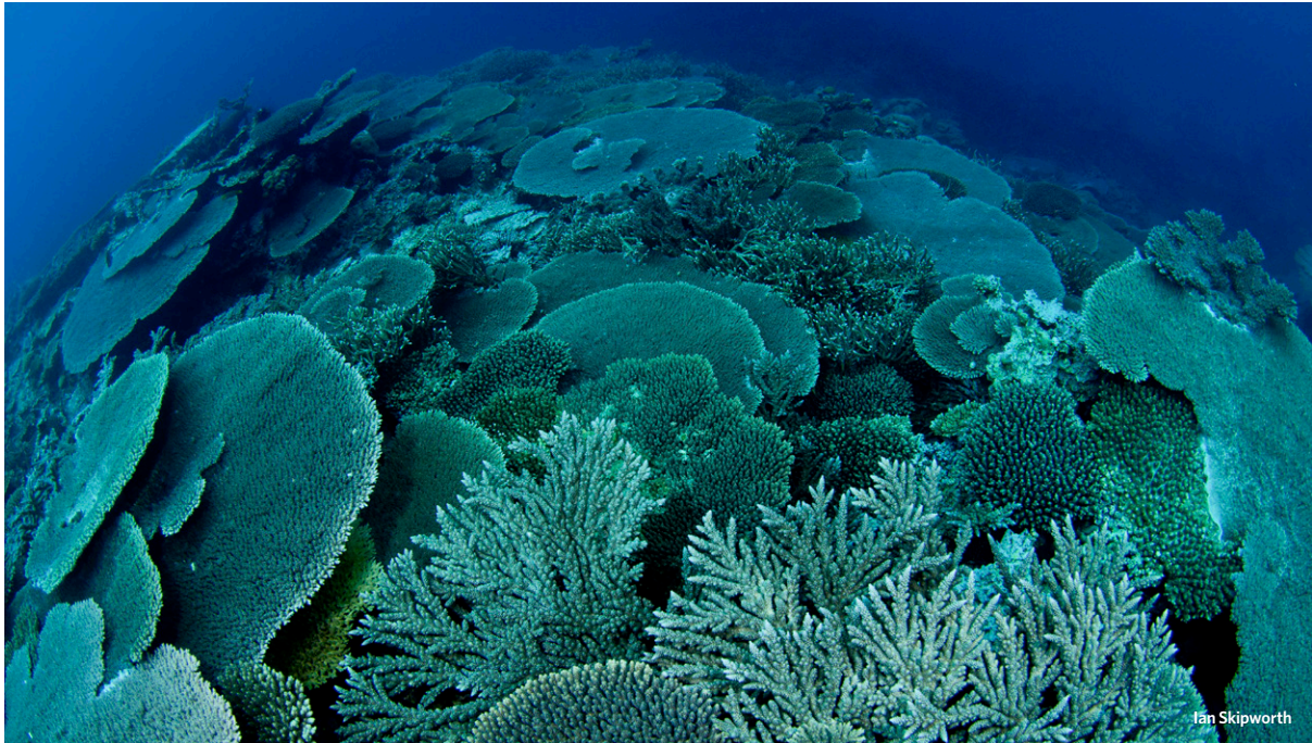
Coral reefs in Rapa, Austral Islands.

Four field expeditions helped supplement the data available in the scientific literature. Those trips included a biological inventory in the waters surrounding the islands of Rapa and Marotiri that was organized by the National Geographic Society; an excursion led by the Auckland Museum of New Zealand that focused on the marine life of the southern islands of French Polynesia, including Rapa and Marotiri; another organized by the French Polynesia Department of Culture and Heritage to analyze ties between the people and the ocean, and a mission to study marine mammals led by the PROGEM (Protection et Gestion des Ecosystèmes Marins) consultancy and the French Polynesia Directorate of the Environment. The authors and others discussed the findings at a conference in Papeete on Feb. 18, 2015.