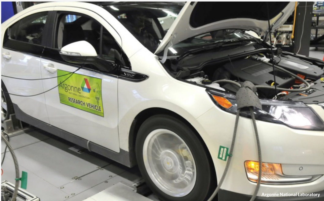
A Chevrolet Volt battery undergoes testing at Argonne National Laboratory.

From discovery through maturation and deployment, the department enabled new ideas to come to fruition, positioning the United States as a developer and manufacturer in the clean vehicle market. In 2014, the country is expected to have produced almost a third of total electric vehicles manufactured worldwide. ‡ Advancements made in conjunction with the DOE have driven more than 50 percent of the growth of the U.S. economy during the past half-century. ‡