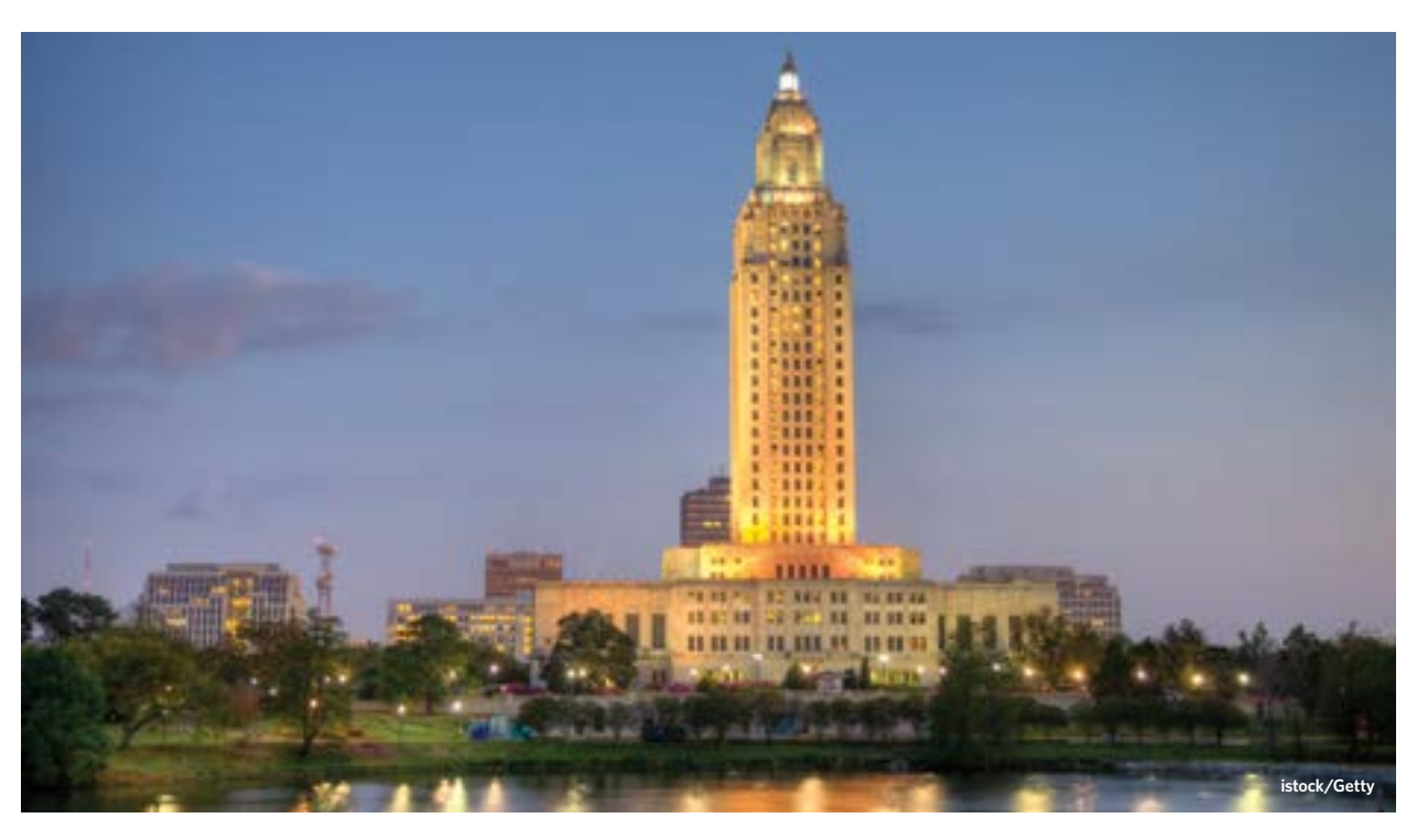
Louisiana State Capitol Building

Act 402 provides additional evidence that reductions in prison time for certain offenders can maintain or even improve public safety while reducing public spending on corrections.