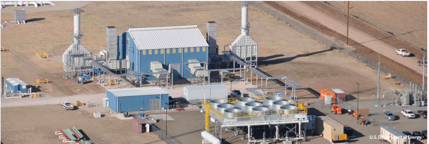
Trailblazer waste heat to power project in northern Colorado.