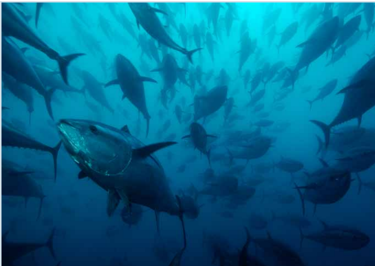
Caged bluefin tuna are being fattened for the sushi market.

The good news is that there is a growing body of science that is improving the understanding of bluefin biology and behaviour and offering hope for a new and better stock assessment model. ICCAT has recognised the need to incorporate this new science into its stock assessment. However, it is critical that, in line with scientific advice, Atlantic bluefin quotas do not increase until these assessments have been updated to reflect the best available science.