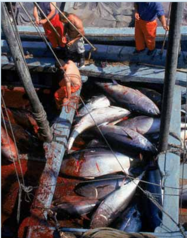
Atlantic bluefin tuna being removed from pens that are set annually off the southern coast of Spain.

Another study, by a scientist from the University of British Columbia, used sophisticated modeling techniques to determine whether historical counts of adults and young better support the high recruitment or low recruitment scenario. The results indicate that the high recruitment scenario is 4.8 times more likely than the low recruitment scenario, and strongly suggest a direct relationship between the number of adults and the number of young 6 . This means that the population is probably able to increase to much higher levels than we see today.