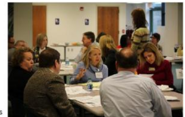
A day of health impact assessment training included time for discussion.

The training is part of the grant that KHI and the University of Kansas School of Medicine - Wichita received to conduct an HIA on a bill involving a Southeast Kansas casino development. During the training, participants learned how to support work on this HIA and build their capacity to conduct future HIAs.