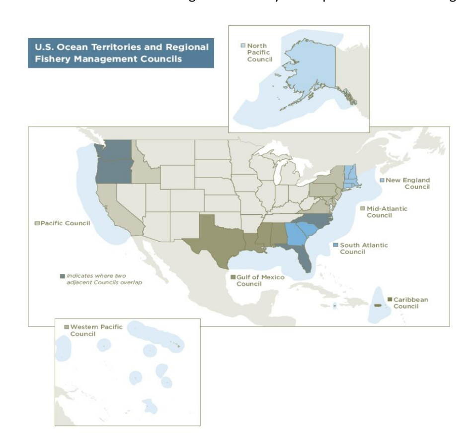
Figure 3: USA's Regional Fisheries Councils

Fisheries in the United States of America are highly diverse from multiple perspectives: ecological, geographical, technological, social, political and economic<sup>9</sup>. The USA is a federated state; it has multiple jurisdictions governing fisheries in both State and Federal waters (inside and outside three nautical miles, respectively). These characteristics are similar to the European Union context, which also embraces cultural and linguistic diversity which present other challenges and opportunities.