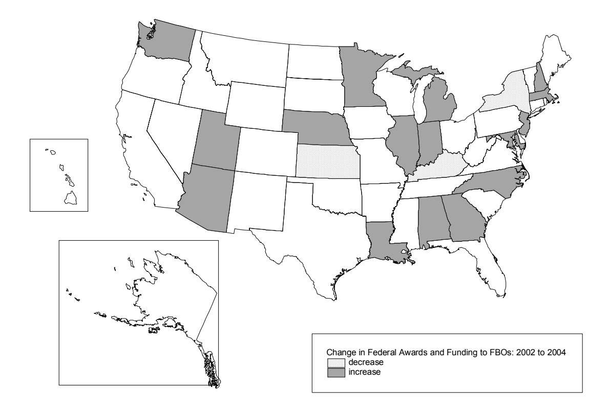
Figure 1. States Where Both Federal Funding and Awards Increased/Decreased to FBOs: 2002 to 2004

While half of the states had decreases in <u>funding amounts</u> to faith-based organizations from 2002 to 2004, only a few had any significant decreases in the <u>number of grants</u> awarded to faith-based organizations (Figure 2). In fact, threequarters of the states had increases in the number of awards going to faith-based organizations.