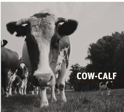
THE BEEF SUPPLY CHAIN

There are only about 5,000 cow-calf operations with more than 500 cows, but these larger operations account for 14% of the total inventory in the U.S. There are about 630,000 operations with 1-49 head. They account for 29% of the total inventory. The USDA says there are 2 million farms in the U.S., total.