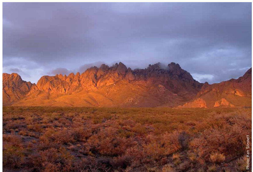
➤ Organ Mountains, New Mexico

The Rogue Wilderness Expansion Act of 2011 (H.R. 3436/S. 2001), introduced by Reps. Peter DeFazio (D-OR), Kurt Schrader (D-OR), and Earl Blumenauer (D-OR) and Sens. Ron Wyden (D-OR) and Jeff Merkley (D-OR). Would safeguard more than 58,000 acres of wilderness in the Rogue River area in southwestern Oregon and designate 143 miles of the Rogue River and its tributaries as Wild and Scenic.