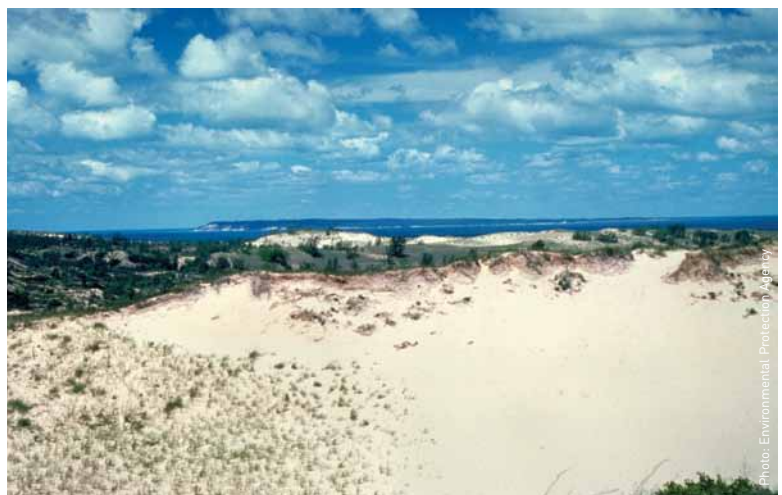
➤ Sleeping Bear Dunes, Michigan

The Pine Forest Range Recreation Enhancement Act of 2011 (H.R. 3377/S. 1788), introduced by Sens. Harry Reid