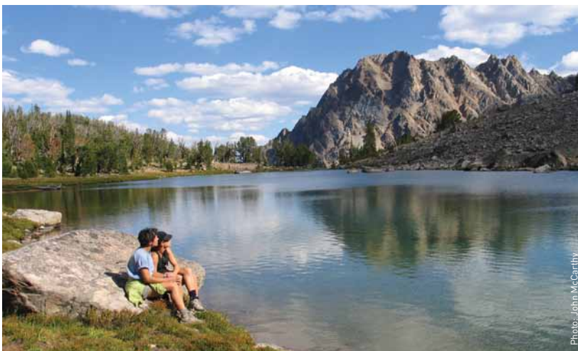
➤ Boulder-White Clouds area, Idaho

The Central Idaho Economic Development and Recreation Act (H.R. 163), introduced by Rep. Mike Simpson (R-ID). Would protect more than 330,000 acres of wilderness in central Idaho, creating three wilderness areas: Hemingway-Boulders Wilderness, White Clouds Wilderness, and Jerry Peak Wilderness. Boulder-White Clouds is the largest unprotected wild roadless area in the national forests of the lower 48 states.