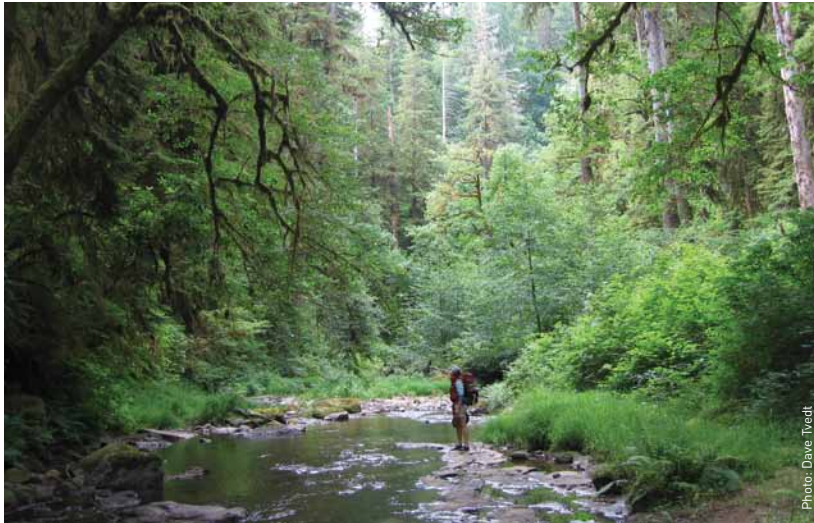
➤ Wassen Creek, Oregon

(D-NV) and Dean Heller (R-NV) and Reps. Shelley Berkley (D-NV), Joe Heck (R-NV), and Mark Amodei (R-NV). Would designate 26,000 acres of wilderness in the Pine Forest Range of northwestern Nevada.