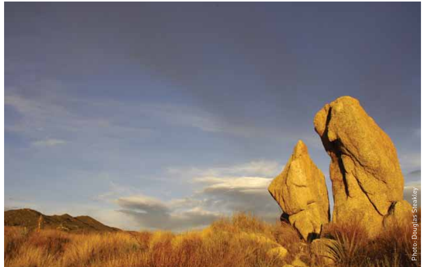
➤ Beauty Mountain, California

The Pinnacles National Park Act (S. 161), introduced by Sen. Barbara Boxer (D-CA). Would designate the area around Pinnacles National Monument in central California as a national park and expand the existing