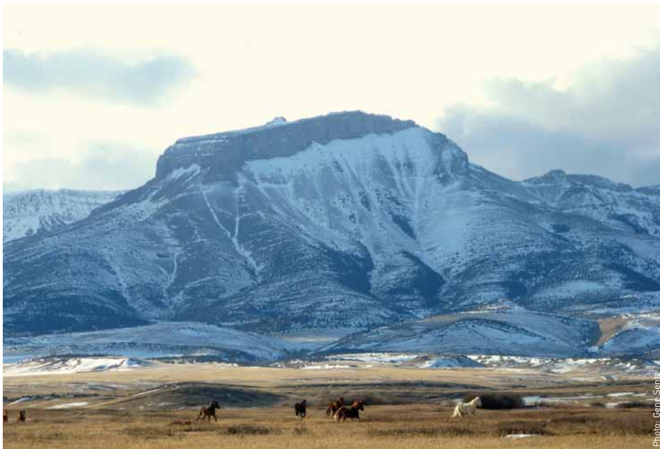
➤ Rocky Mountains, Montana

“Wilderness, unspoiled by man, is deeply rooted in American history and tradition. In the past, our task was to conquer it. Today we must struggle to preserve remaining wilderness areas that still offer the rewards of solitude and unmarred natural grandeur.”