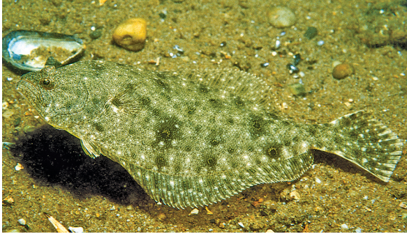
SUMMER FLOUNDER ( PARALICHTYS DENTATUS )