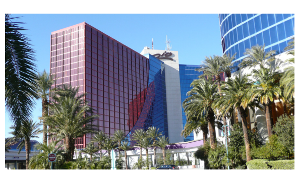
Rio Las Vegas

The Rio is home to the first CHP system on the Las Vegas Strip. Installed in 2004, the 4.9-MW system generates 40 percent of the electricity, 60 percent of the hot water and 65 percent of the heat needed by the hotel-casino. The efficient combination of on-site heat and power generation reduces the property's annual energy bill by about $750,000, resulting in a positive return on investment for the project. These savings are reflected in lower electric bills for the property. Heat recovered from the generator stacks and engine jackets, combined