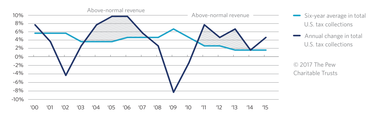
Step 1: Identify above-normal revenue growth level.

States should set aside a percentage of their annual revenue when growth exceeds its typical rate. For example, Virginia saves half of all revenue above its average six-year growth rate, a practice that Moody's praised as "a strong feature of its Aaa rating" that "will help to prepare it for future downturns."