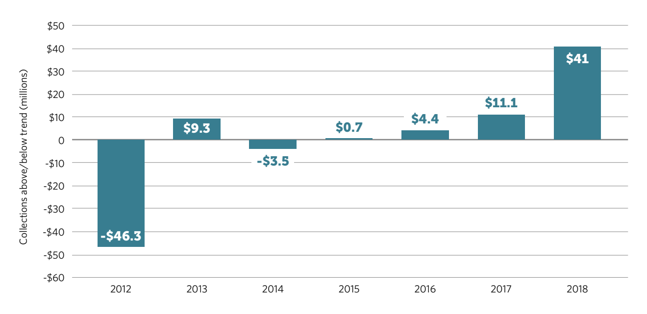
Figure 4 Utah's Sales Tax Revenue vs. 15-Year Trendline, 2012-18 State identifies periods of nonrecurring growth, shortfalls in major tax sources