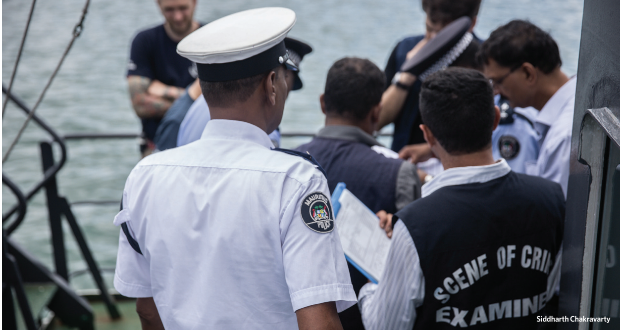
Mauritius police and Interpol officers examine evidence and collect eyewitness accounts of illegal fishing from the crew of Sea Shepherd Conservation Society.