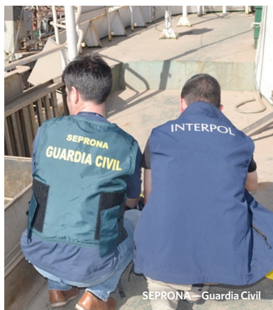
Members of an Interpol Investigative Support Team (IST) examine the Asian Warrior, formerly the Kunlun, in Dakar, Senegal.

Project Scale uses a team of experts in intelligence collection and analysis to help countries decipher the complex business networks behind illegal vessels.