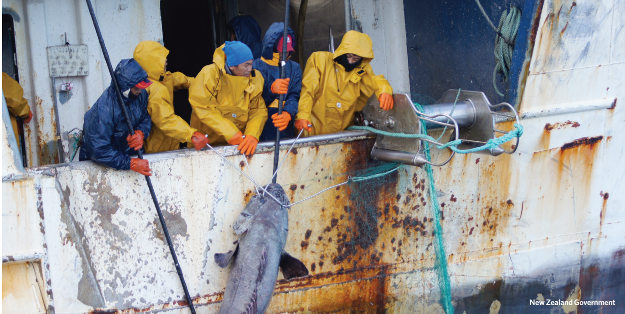
Crew members of the fishing vessel Kunlun retrieve a gill net with toothfish in the CCAMLR Convention Area.