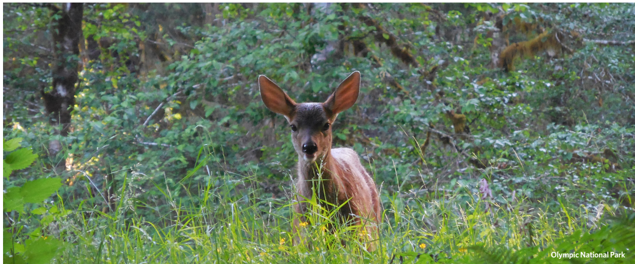
Olympic National Park

Olympic National Park is teeming with wildlife, including deer.