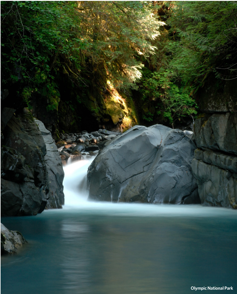
Olympic National Park