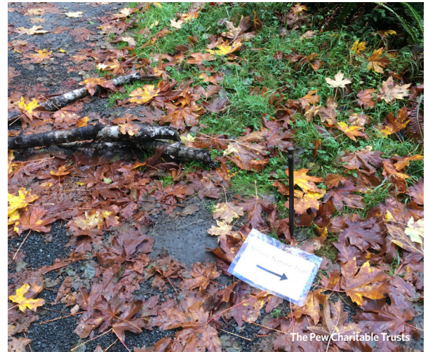
The Pew Charitable Trusts

The park's trail system has over $5.5 million in deferred maintenance, resulting in temporary markers along the Hoh River Trail.