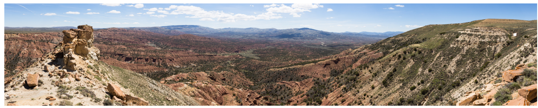
Red Creek Badlands.

Dollar values rounded to the nearest thousand. Totals may not sum due to rounding. Source: ECONorthwest