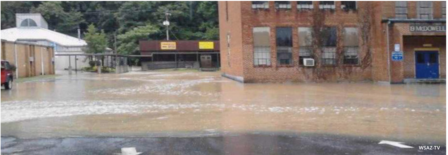
Flooding in 2013 caused $60,000 in damage to McDowell Elementary School in McDowell, Kentucky.