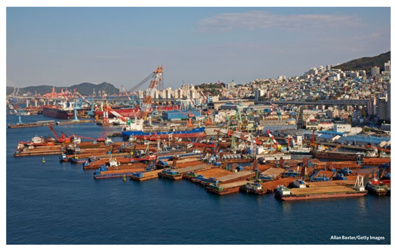
South Korea was one of the first 25 States to ratify the Port State Measures Agreement. Its largest port, Busan, is pictured above.

Each country is different in relation to its geographical setting, procedures for arranging meetings and gaining access to information, institutions and personnel. The following is a rough guideline to assist a consultant or other external facilitator in allocating time required for conducting a CNA in one port. This does not include time for travel or preparation for meetings. Experience shows that being flexible is the best approach.