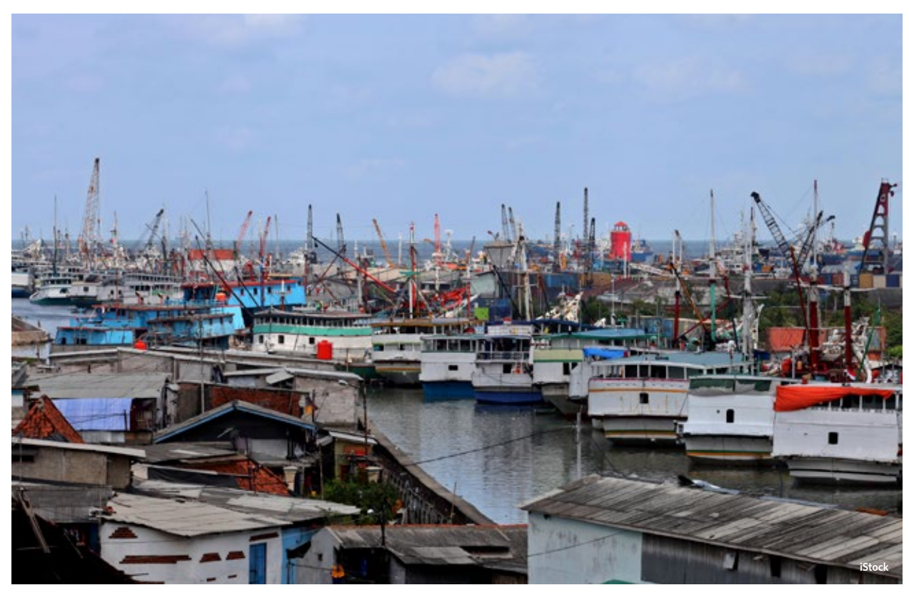
Ports are the primary access point for fish to enter into market. The Port State Measures Agreement will help keep foreign-flagged fishing vessels suspected of illegal fishing from landing their catch and ultimately keep illicitly caught fish out of the global seafood market.