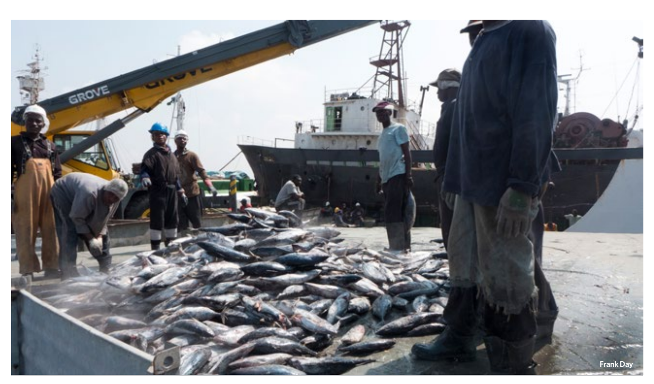
Fishermen sort catch at the port of Tema, Ghana. While there are no indications this crew was operating illegally, Ghana is among many developing countries that are hard hit by large-scale illegal fishing.

In cooperation with the New Partnership for Africa's Development (NEPAD), through its Stop Illegal Fishing (SIF) Working Group, and six African countries,<sup>1</sup> Pew has supported the development of a capacity needs assessment (CNA) methodology, part of a set of tools that we have committed to help develop to ensure that States have the necessary instruments to effectively implement the PSMA and can move quickly towards closing all ports to vessels engaged in illegal, unreported and unregulated (IUU) fishing.