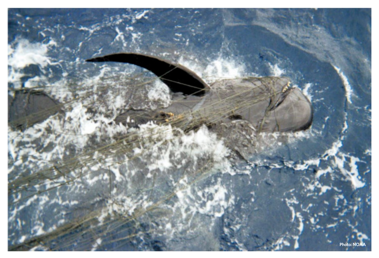
Drift gillnets targeting swordfish also entangle many other species of marine life, including the pilot whale shown here.

Thousands of nontarget animals are caught in these impenetrable walls, a problem known as bycatch, including endangered sperm whales, Pacific leatherback turtles, and valuable but severely depleted game fish such as bluefin tuna. In fact, the severe injury and death of two sperm whales in December 2010 prompted federal fishery managers to enact a temporary emergency rule requiring observers on all drift gillnet boats.